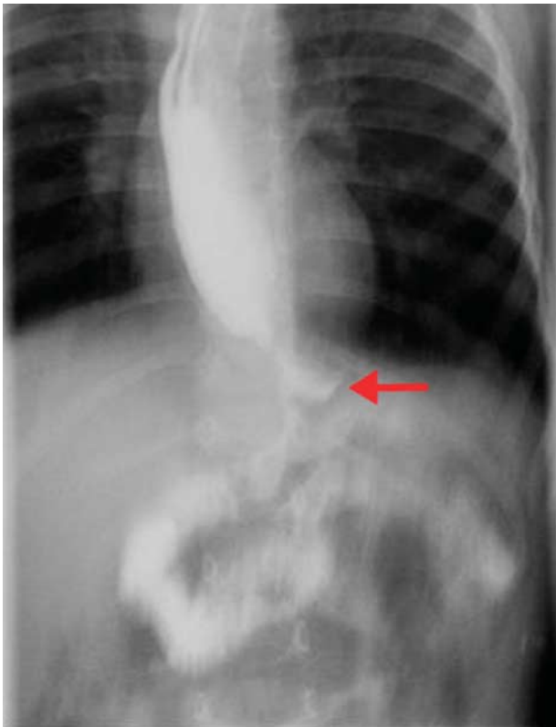
Upper gastrointestinal contrast study showing dilated esophagus with a microstomach (arrow).