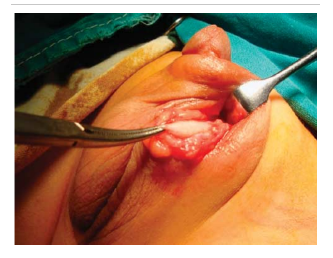
Dissection of the testis first.

that dissection would allow the external ring to be identified (Fig. 2).