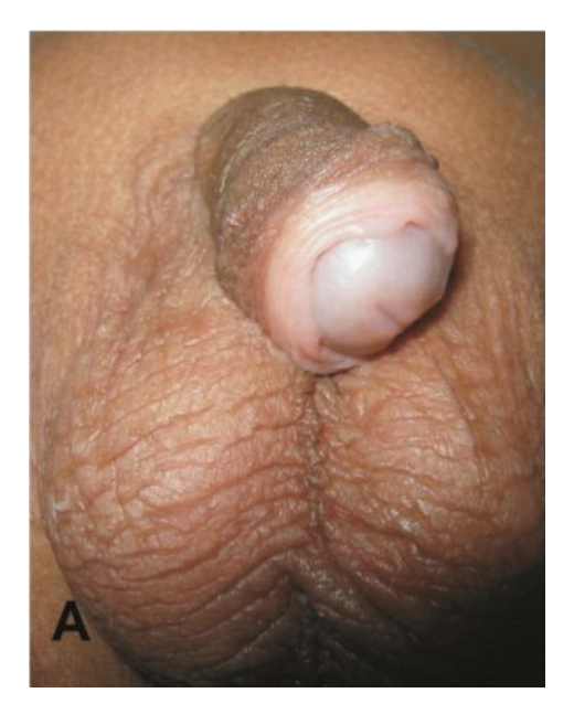
glanular hypospadias and penile torsion