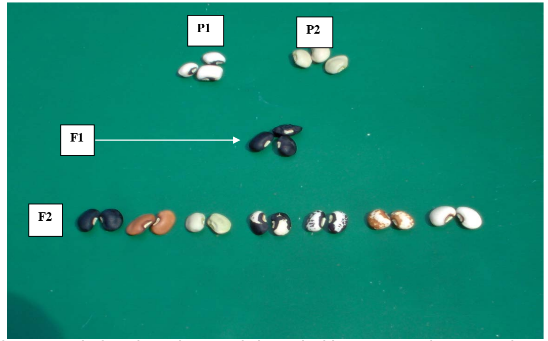
Plate 3: Segregation for seed coat colour pattern in the cross involving IT98K-628-1and IT98K-1095-5 (Mag.x1) P1 = IT98K-628-1, P2 = IT98K-1095-5