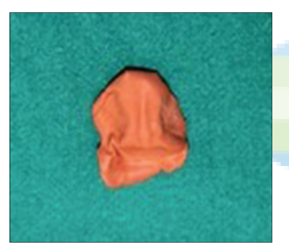
Figure 7: Dental putty maxillary impression