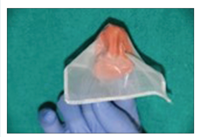
Figure 6: Hybrid impression retrieved in toto

thread [Figure 9]. It was finished and polished for smooth surfaces. The neonate could comfortably perform sucking with the feeding obturator [Figure 10]. The mother could feed the child immediately after insertion without nasal regurgitation.