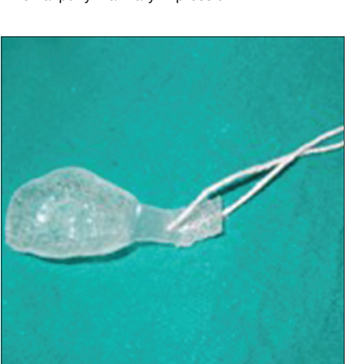
Figure 9: Clear soft feeding obturator with safety thread attached