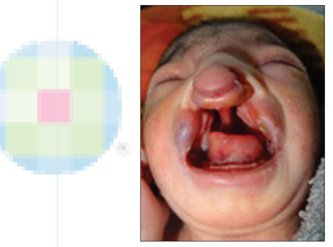
Figure 2: Intraoral view showing cleft lip and palate