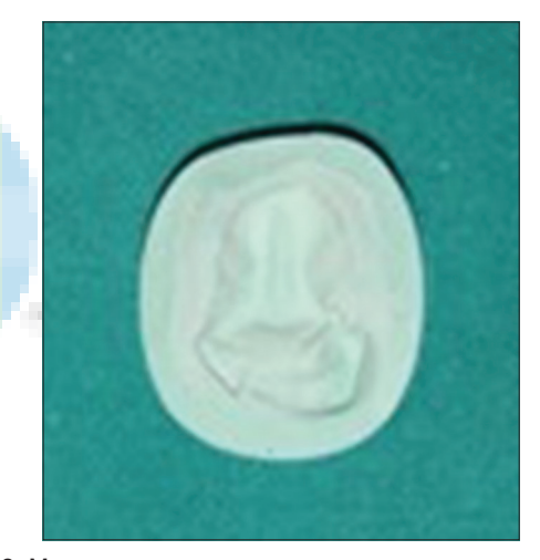
Figure 8: Master cast