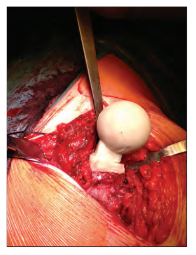
Figure 6: After hardening of the cement, the spacer is removed from the mold and inserted into the femur

Since the decrease of the femoral offset needs to be adjusted, the two mold parts should not be completely attached to each other. The gap between the two mold