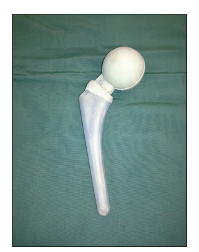
Figure 5: The gap between the mold parts is manually filled with antibiotic-loaded bone. This cement ring should be broader than the spacer stem in order to act (1) as a bearing base onto the proximal femur, which might prevent possible sintering of the spacer into the femur and (2) contribute to the preservation of an adequate muscle tension