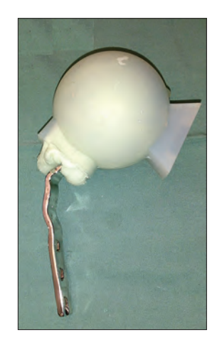
Figure 3: The technique is demonstrated with a Biomet<sup>®</sup> silicon mold. The mold is cut with scissors through the spacer neck area. Antibiotic-loaded bone cement is first inserted into the head mold and then the bended plate is inserted. The depth of the insertion is defined in accordance with the offset adjustment required in a particular case