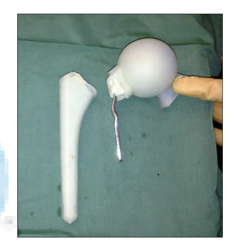
Figure 4: The stem mold is filled with antibiotic-loaded bone cement, and the two parts of the mold are attached to each other with a small gap in between