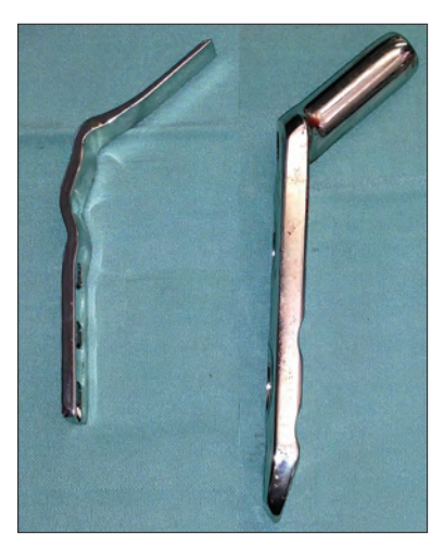
Figure 2: The blade plate is recommended for small femoras and DHS for large femoras