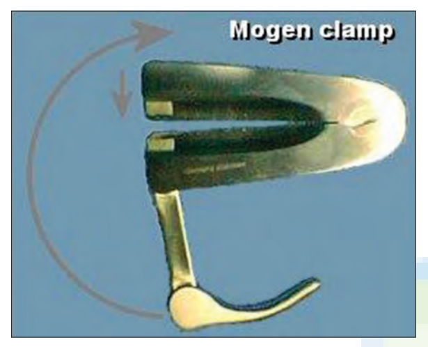
Figure 1: Mogen clamp

Grooved sleeve is passed over the glans to sit just behind the corona. The prepuce is then replaced over this sleeve. A hinged plastic clamping ring is fitted over the sleeve [Figure 5], the position of the prepuce is adjusted and the nut tightened to hold the prepuce in place. An elastic cord is then wound tightly around the phallus, compressing the prepuce into the groove of the sleeve below it. This constricts the prepuce distally. The glans and frenulum are protected so that the frenulum remains intact. Too tight a sleeve can result in glans necrosis and too loose, one can give poor cosmetic outcome.