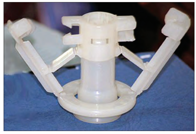
Figure 6: Tara klamp