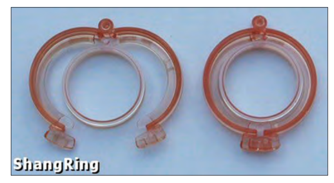
Figure 8: Shang ring

Circumcision wound may become infected, as in any surgical procedure. The incidence of infection in one series of neonatal circumcisions was 0.4%, [8] while in a series of older boys it was as high as 10%.[8,12-14]