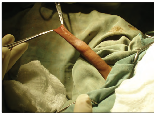
Figure 12: Crushing the prepuce with artery clamp before incision