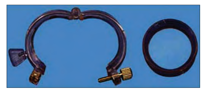
Figure 5: Zhenxi ring