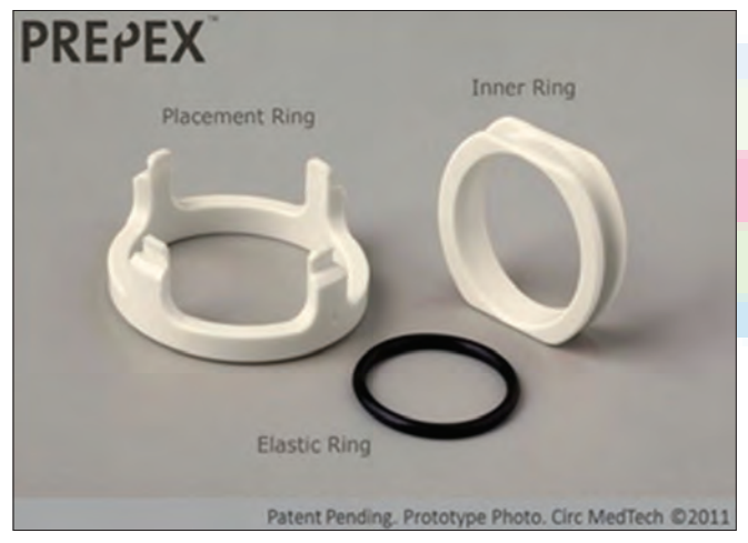
Figure 9: The PrePex® device