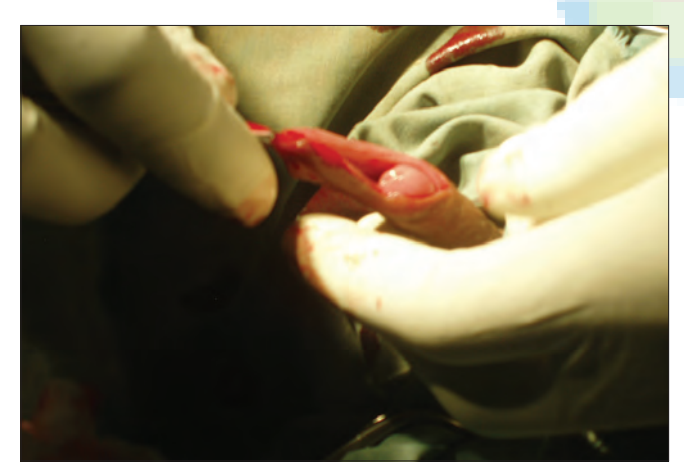
Figure 3: Dorsal slit