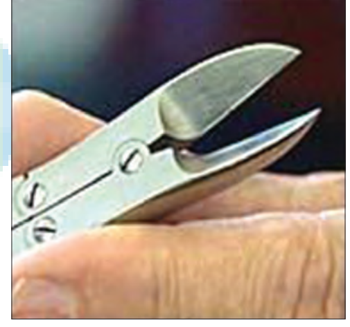
Figure 10: Bone cutter for use in guillotine method