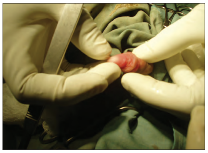
Figure 11: Full preputial retraction

resultant pain or penile curvature. Treatment is to release the bridges.