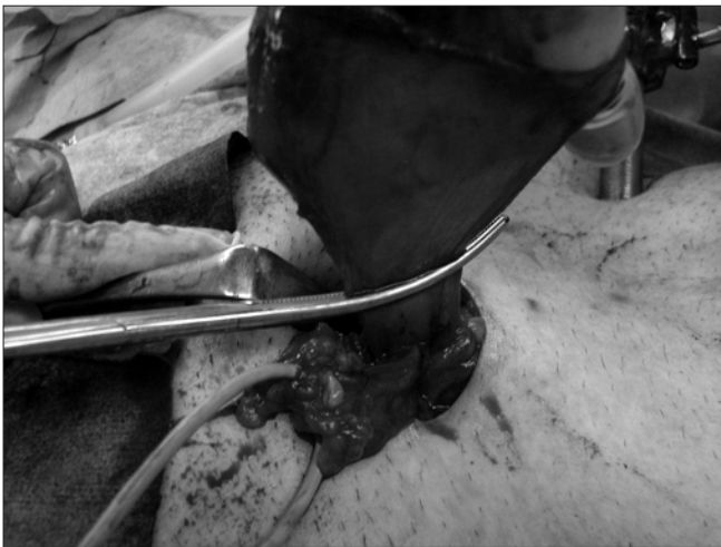
Figure 3: After the hernia sac was clamped with Kelly forceps, pneumoperitoneum was re-established