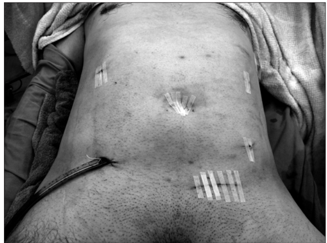
Figure 4: At the end of the operation, the patient had only a hernia repair wound and five trocar wounds

wound was irrigated with a copious amount of saline. Thereafter, the hernia sac was ligated in the neck and the inguinal hernia was repaired with a mesh [Figure 4]. His postoperative course was uneventful without surgical site infection, and he was discharged ten days after the operation.