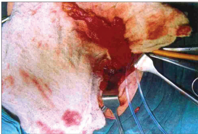
Figure 2: Peri-vesical fat flap harvested