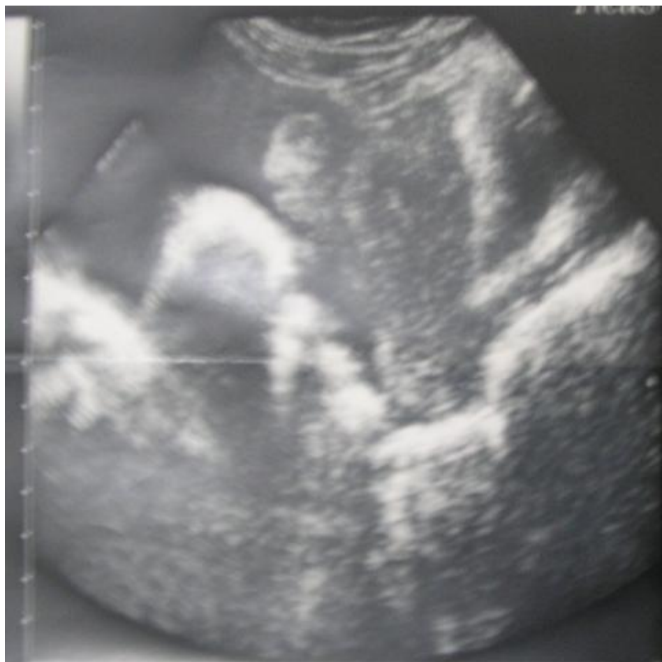
Figure 1: Abdominal pelvic ultrasound in longitudinal section Heterogeneous mass behind uterus with 4 centimeters of biggest diameter

letters to the editor. European journal of obstetrics and gynecology and reproductive biology. 2005; 122: 243-251. PubMed | Google Scholar