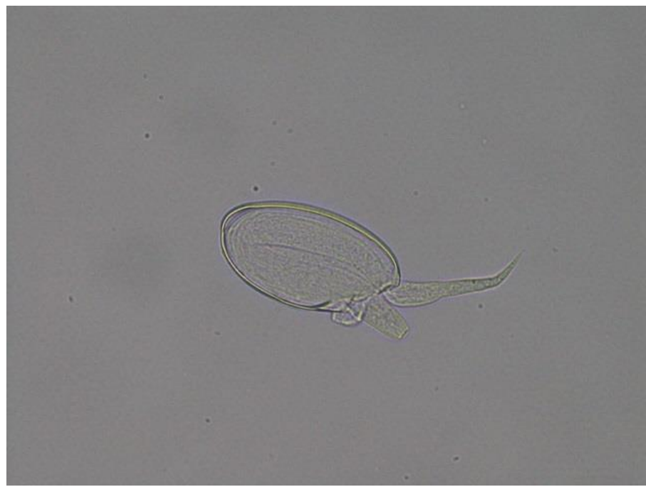
Figure 2: Microscopy of the egg of enterobius vermicularis which is approximately 25x60µm in size