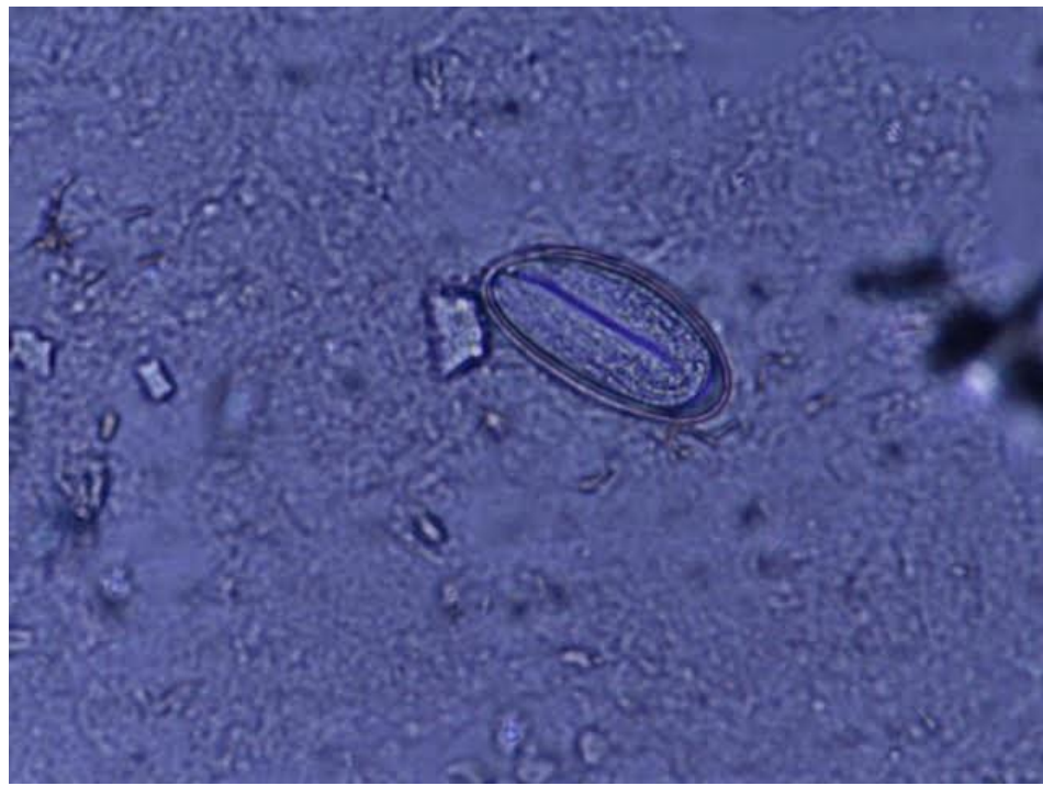
Figure 4: Microscopic image of enterobius vermicularis egg from specimen collected with a clear adhesive tape from the perianal area