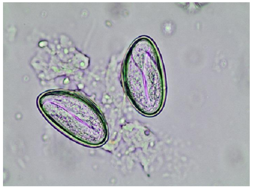
Figure 1: Microscopic caption of enterobious vermicularis eggs