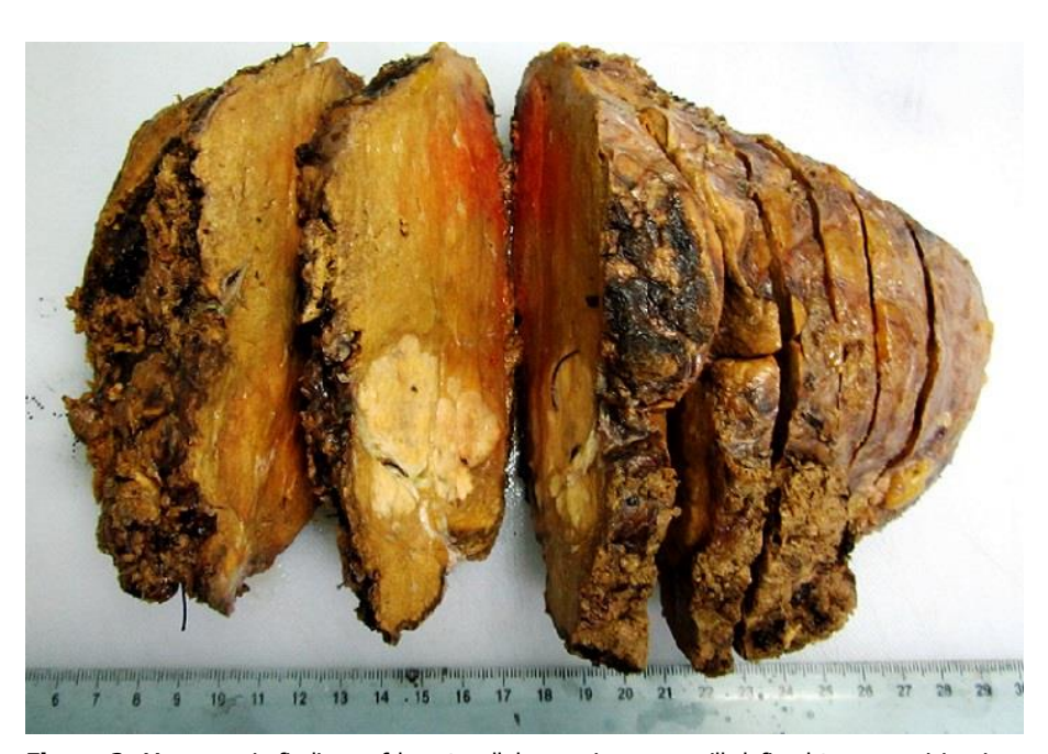
Figure 2: Macroscopic findings of hepatocellular carcinoma; an ill-defined tumour arising in a non-cirrhotic liver