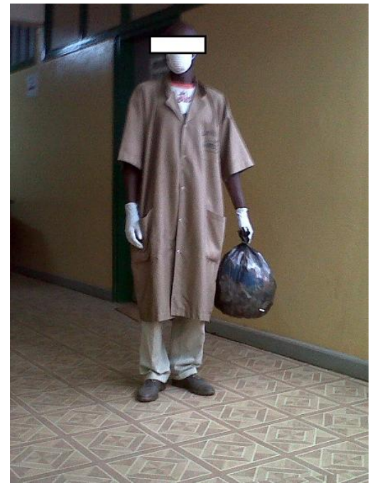
Figure 3: Transport waste to the central storage area of national laboratory.