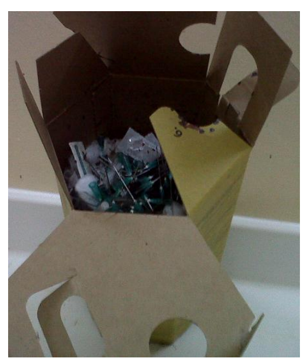
Figure 2: Safety box exceeding the filling 3/4 of its content before proceeding to their elimination.