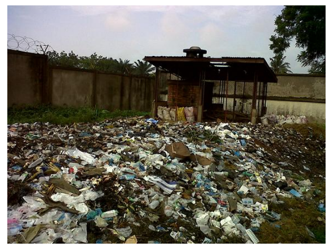
Figure 5: the hospital hygiene service violates the waste disposal timing. Therefore, these wastes are spread around the storage center has the Bangui community hospital