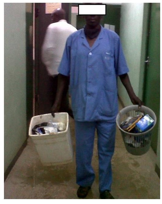
Figure 4: The surface technician has no glove, cart, or flap during transport of waste services to the central storage area of the laboratory community hospital in Bangui