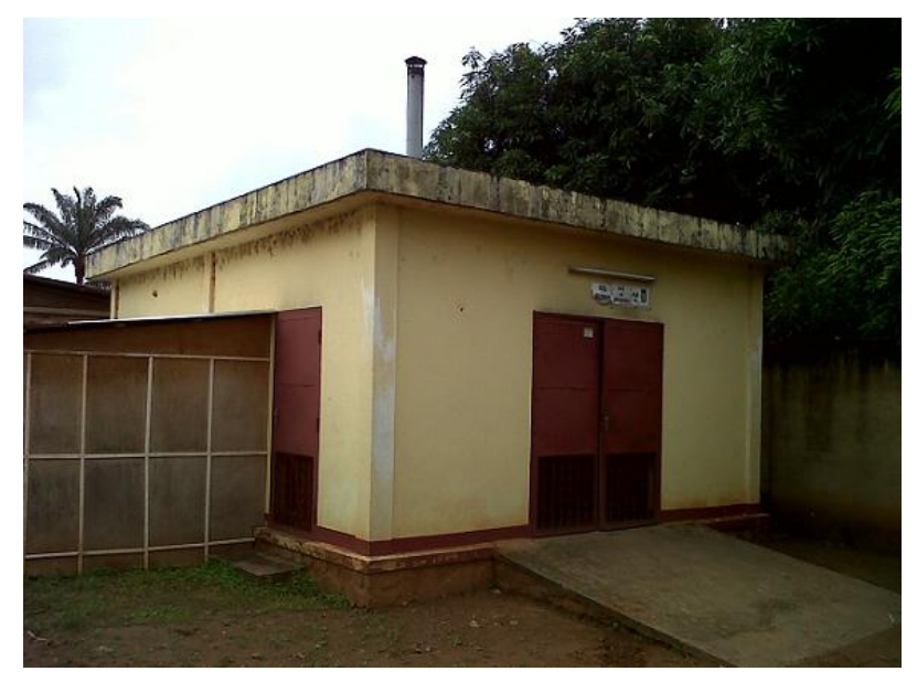
Figure 6: Pyrolysis type of incinerator at the national laboratory is semi-modern with little release smoke during waste disposal