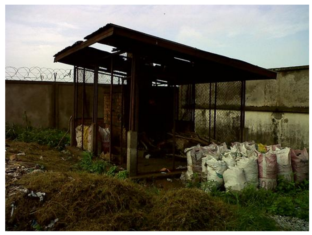
Figure 7: Montfort type of incinerator at the laboratory of community hospital is an old inefficient incinerator, with significant smoke during waste disposal