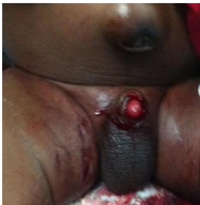
Figure 3: Post-circumcision bleeding