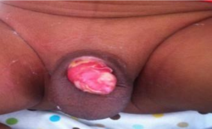
Figure 5: Post-circumcision wound infection