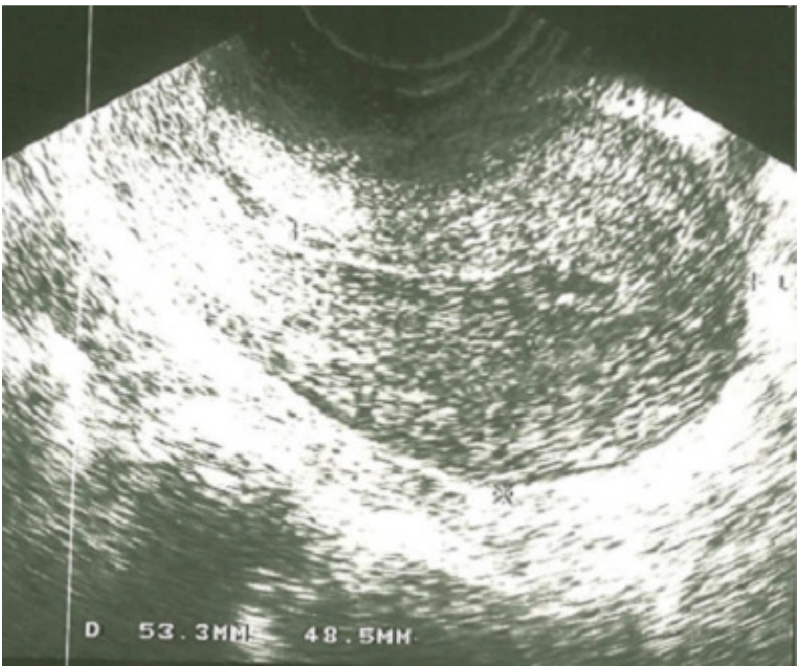
Figure 3: Pelvic ultrasound normal