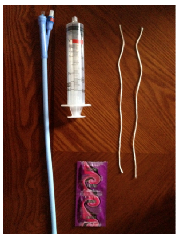
Figure 2 : The balloon device include a catheter, a condom and a 60 ml syringe