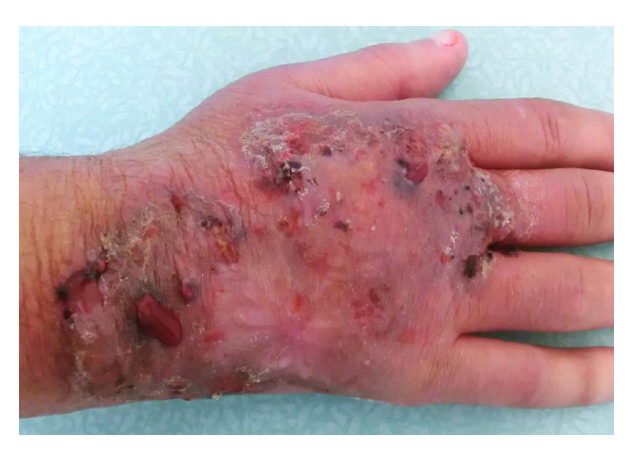
Figure 1: Erythematous plaque with vesicular bubbles, elevated edge, interesting the back of the right hand and wrist