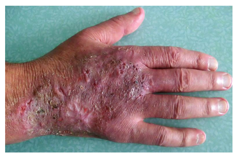
Figure 6: Early desinfiltration and healing in day 7 of treatment with regression of bubbles