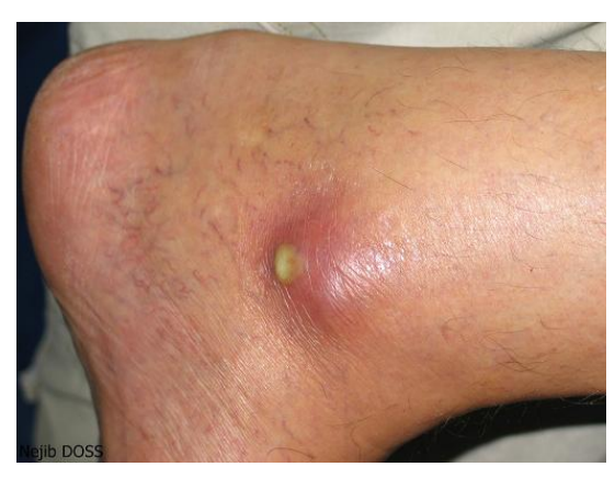
Figure 3 : Infiltrated erythematous plaque of the left ankle surmounted by a large pustule