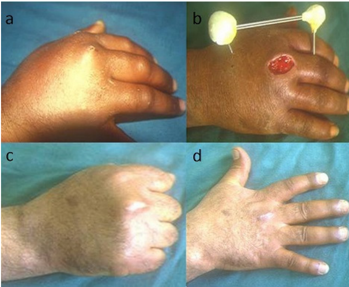
Figure 2: Arthritis stage 2 of the MP joint of the right middle finger (a), treated by excision and stabilization by Beaubourg's external fixator (b), provided healing with a good functional and aesthetic result (c, d)