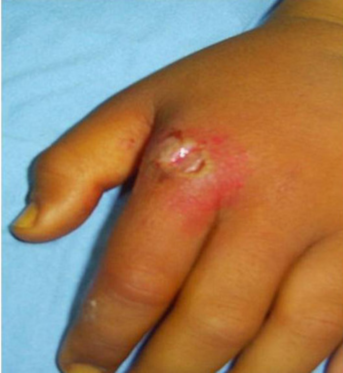
Figure 1: Infected wound on the dorsum of the left hand in front of the MP joint of the index following a fist against the teeth