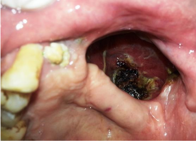
Figure 2: Intra oral image showing surgical defect with necrotic bone and necrotic slough