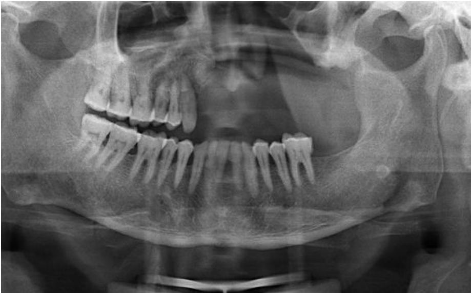
Figure 3: Panoramic radiograph showing multiple missing teeth and features suggestive of left maxillectomy