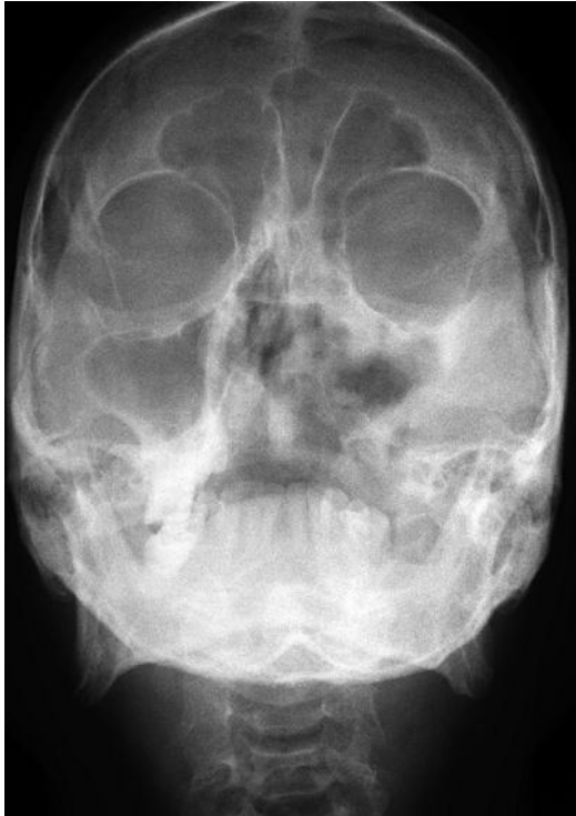
Figure 4: Para nasal sinus view showing irregular diffuse radiolucency involving left maxillary sinus suggestive of osteomyelitis