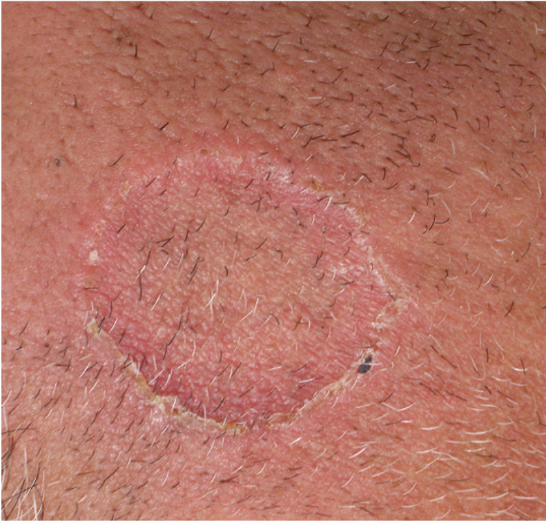
Figure 1: erythematous annular lesion of the left cheek, with well-demarcated keratotic and filiform border