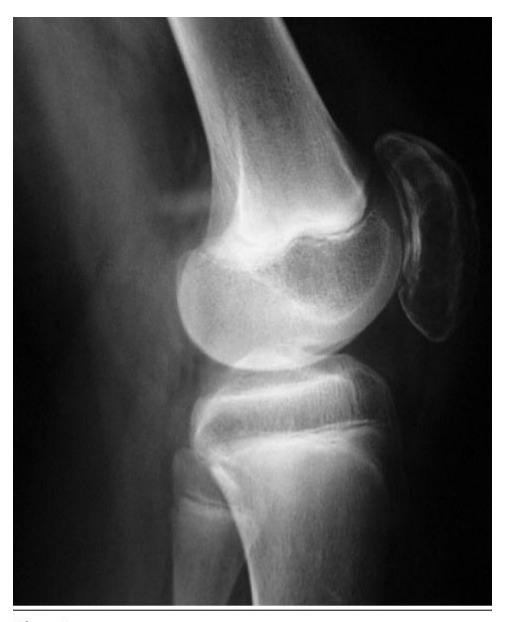
Figure 1 Radiography of the right knee showing an osteolytic lesion involving the hole patella