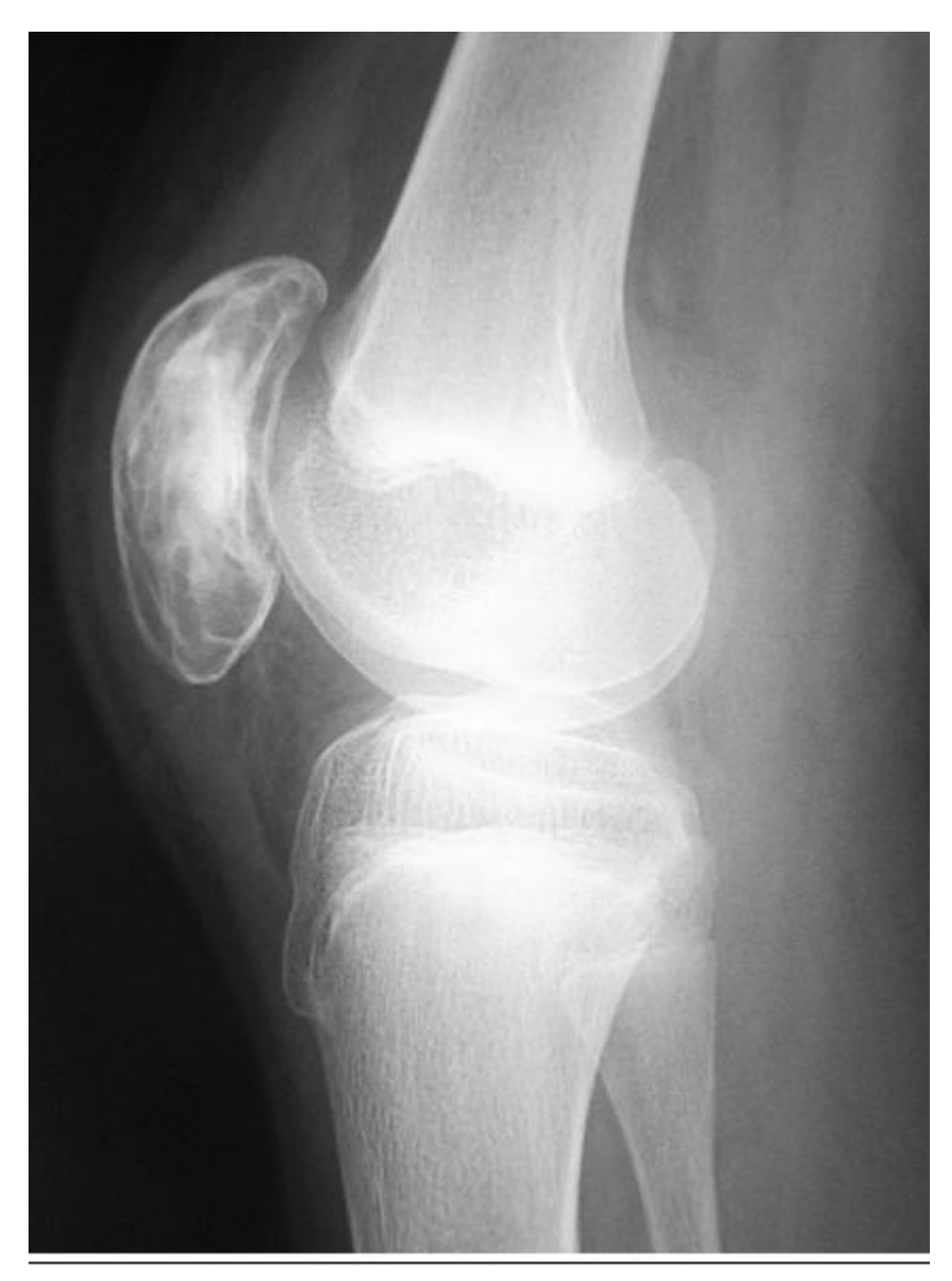
Figure 3 Radiography of the right knee showing the iliac graft packing of the patella