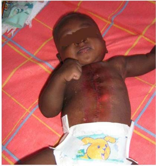
Figure 2: The same child after surgery. No more swelling. The heart now is in "the chest"