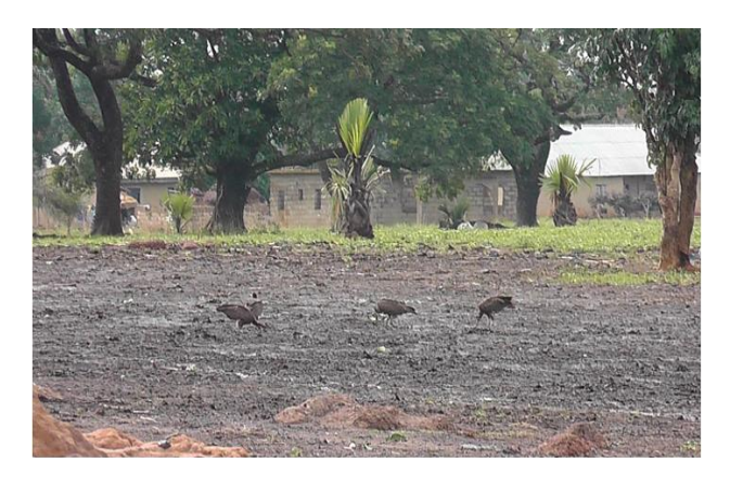
Plate1: Hooded vultures feeding on maggots/beetles emerging from the cow dung