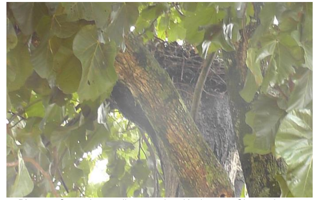
Plate 5: Second nest discovered at Kpokap on Giant cola tree ( Cola gigatea ) at about 8.5m above the ground