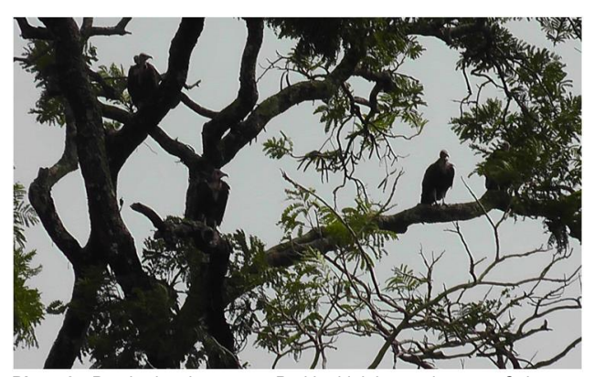
Plate 2: Perched vultures on Parkia biglobosa close to Cola gigantea