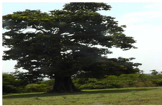
Plate 3: Cola gigantea one of the nesting trees