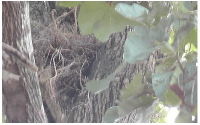
Plate 4: First nest discovered at Kpokap on Giant cola tree ( Cola gigatea ) at about 9.5m above the ground