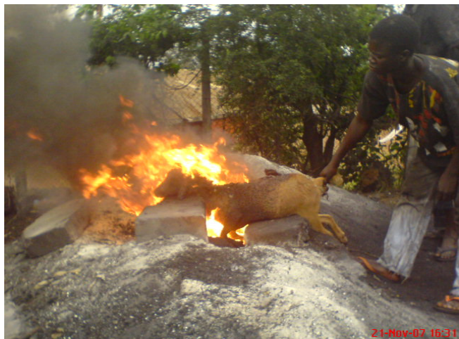
Figure 3. Singeing of goat in open fire fuelled with scrap tyres

Products Order, 1973). Thus, prior to singeing with the scrap tyres, the hides were already contaminated with unacceptable levels of Cd, Zn and Pb. This might be reflecting undue levels of heavy metal exposure in the local environment. The animals could potentially have picked heavy metals from the environment given the challenges of free-range grazing, scavenging in open waste dumps for fodder, drinking water from polluted drains and streams and exposure to atmospheric depositions especially from automobile fumes and open burning of solid waste. Indeed, close correlation have been reported between heavy metals concentration in cattle tissues with that in soil, feed, and drinking water (Qiu et al., 2008). Generally, toxic heavy metals such as Pb and Cd have slow rate of elimination such that harmful levels could accumulate in tissues after prolong exposure to even low quantities in the environment (Humphreys, 1991; Sharma et al. 1982; Doyle and Spaulding, 1978). The un-singed hides have levels of Cu falling within permissible limit of 20.0 mg/kg (Meat Food Products Order, 1973). With regards to Mg, Mn and Ni, it is unclear whether the background levels recorded in the hides may constitute significant problem to meat consumers; this is because of their role as essential heavy metals. As contaminants however, no MPL have been fixed for them in meat.