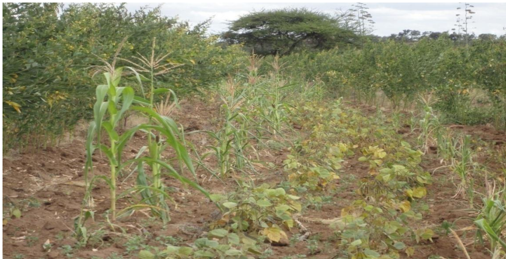
Figure 3. Intercropping of Vigna radiata , Zea mays and Cajanus cajan in alley farming

under water stress conditions and may also reduce a farm's water requirements (FAO, 2012; CGIAR, 2012). Early maturing varieties of these crops such as V. radiata have proved especially useful for helping dry land communities get through the "hungry season"- period before harvest when the previous year's grain supplies have been exhausted. The successful harvests that farmers have had after sowing the drought tolerant crops suggest that food security could be better achieved if more farmers grew adapted crops which survive dry spells and erratic rainfall (ICRISAT, 2011).