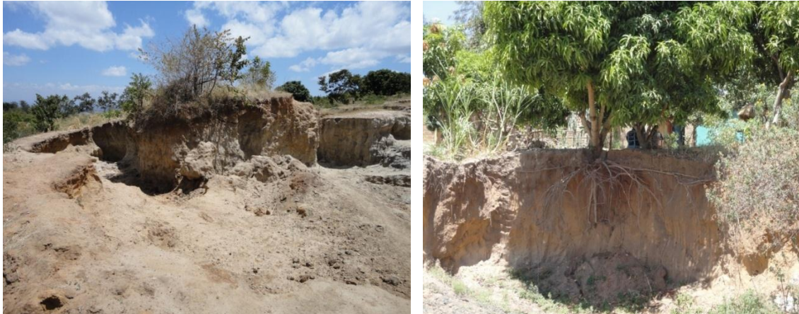
Figure 2. Impacts of sand harvesting on the farms at Manaja area.

transmitted diseases such as AIDS (38.5%) and divorce (16.5%) among others were reported (Table 2).