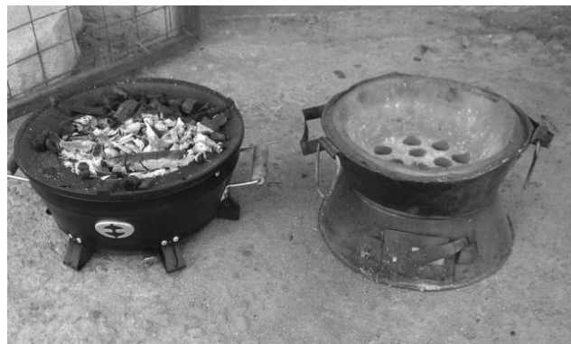
Figure 5. Charcoal stoves. Improved stove, left (Ecofit), traditional stove, right. Ecofit diameter is 31 cm.