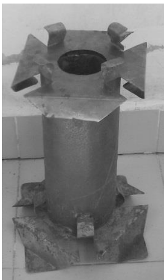
Figure 3. St. John's (SJUT) stove.