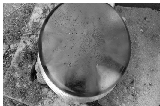
Figure 6. Typical soot with tar on pot bottom after cooking on natural draft TLUD stove with pellets.

had not learned the importance of adjusting the air vent, despite careful instructions at initial disbursement and a follow-up visit. This appears to be a major reason for the excessive smoke problem. The oil content of the pellets may play a role in smoke production; however, when the same pellets that produced smoke in the ND stoves were used in the Philips fan stove, smoke was not a problem. The 30 min ignition time for charcoal reduces its advantages, along with the