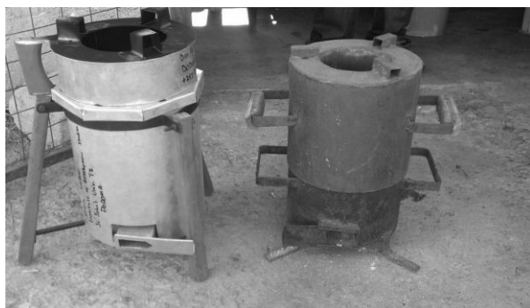
Figure 2. Troika (left) and Jiko Bomba TLUD stoves. Primary air vent can be seen at bottom of both.