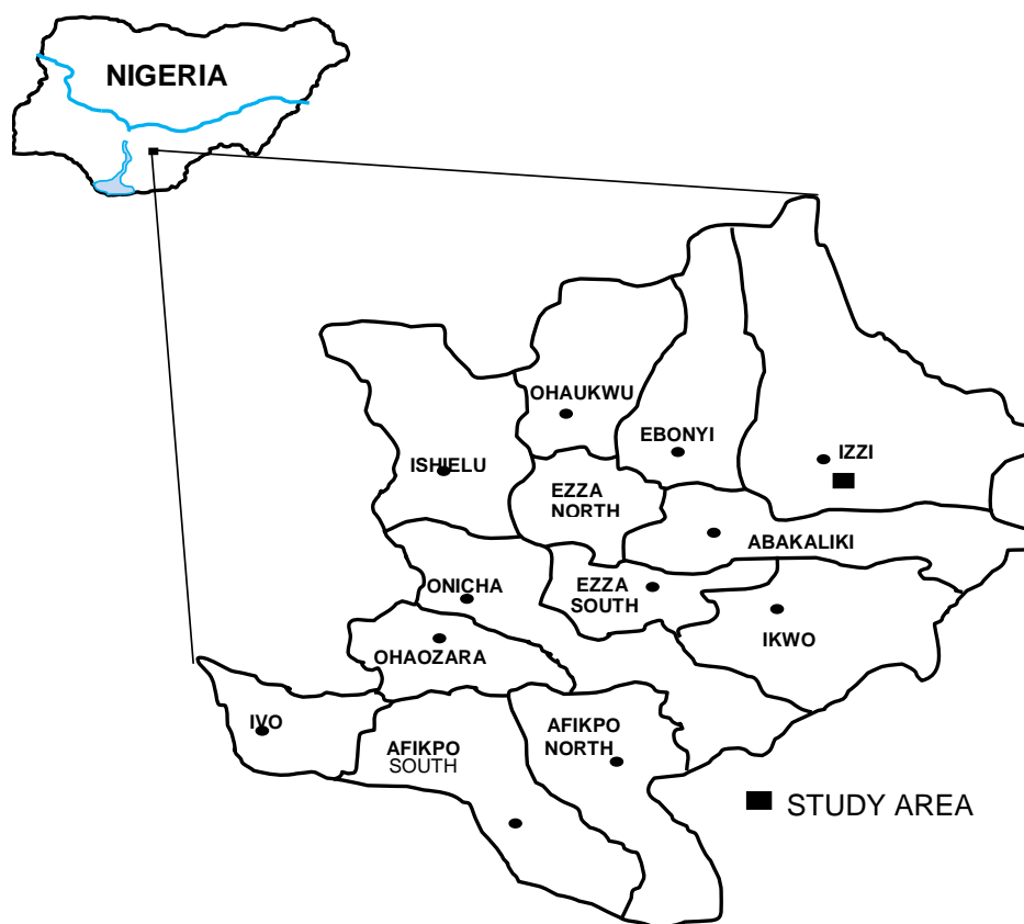
Figure 1. Map of Ebonyi State indicating the study area.

a particular process or environment. Gressly was the first to use the word in 1838 (Cross and Homewood, 1997). Establishment of sedimentary facies depends on the aspect of the sediment that is under study. If petrological characteristics are understood properly, lithofacies can be established; if paleontological characteristics are understood, biofacies are established. In this work, petrological characteristics of the rocks of Nkpumakpatakpa were used to establish lithostratigraphic units and their corresponding lithofacies. The objectives of this work include: i) To map and demarcate the lithologic units underlying the study area; ii) To make a detailed description of different rock types encountered; iii) To discuss the map, lithofacies units and interpret their depositional environment.