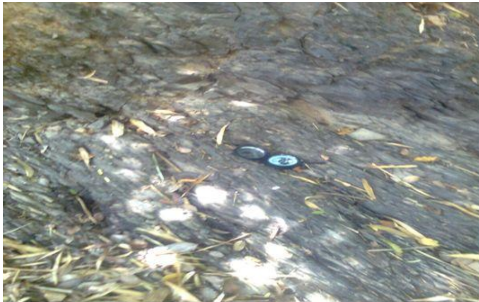
Figure 8. Field occurrence of the dark-grey shales at Nkpuma-akpatakpa.

by parallel arrangement of micaceous minerals, organic matter content or diagenesis. However, fissility occurring in this shale is brought about by the mechanical arrangement of clay and micaceous minerals during diagenesis. Lamination as observed in the dark-grey shales is diagenetic in origin. They occurred as a result of the diagenetic cementation of organic matter contained in the rock.