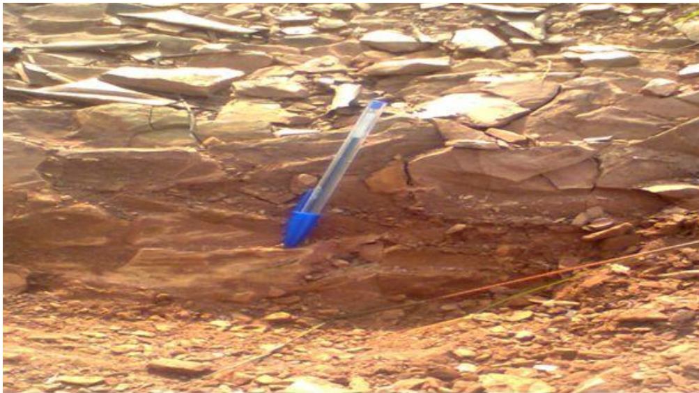
Figure 6. The joints in the brown shale unit.