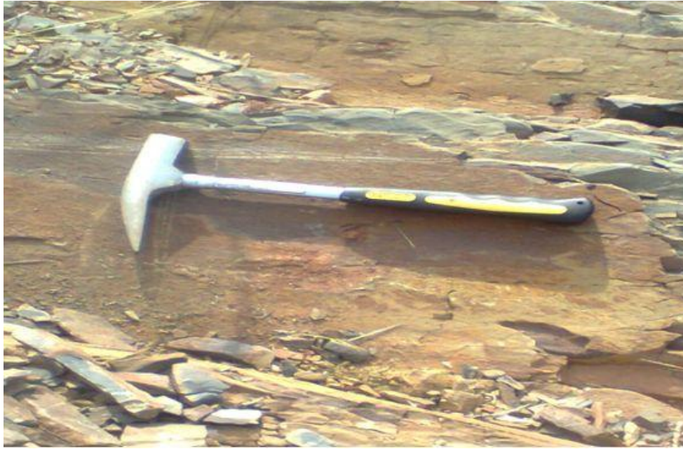
Figure 5. Field occurrence of the brown shales at Obeagu - Ikenyi.