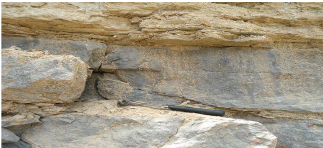
Figure 3. The pyroclastic rocks underlying the Ezzaegu areas.