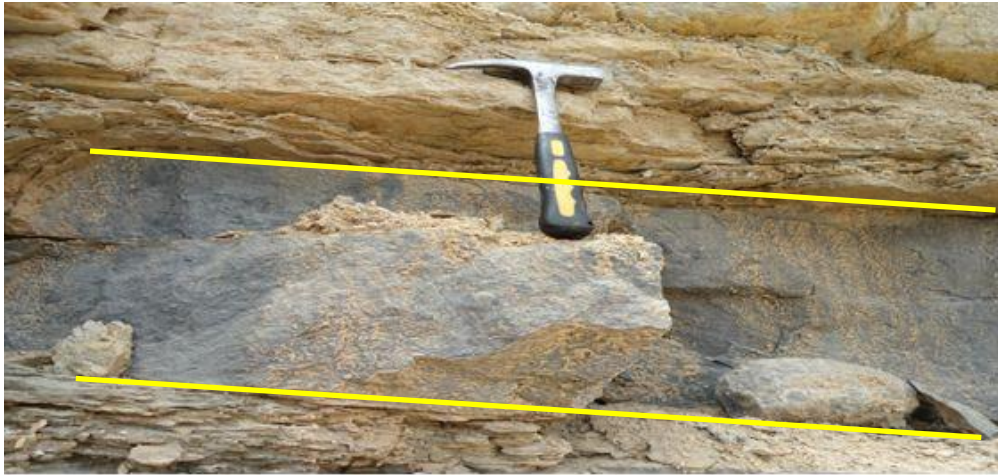
Figure 7. The pyroclastic rocks interbedded with the shales at Ezzaegu. The yellow line shows sharp contact between the pyroclastic and shale.