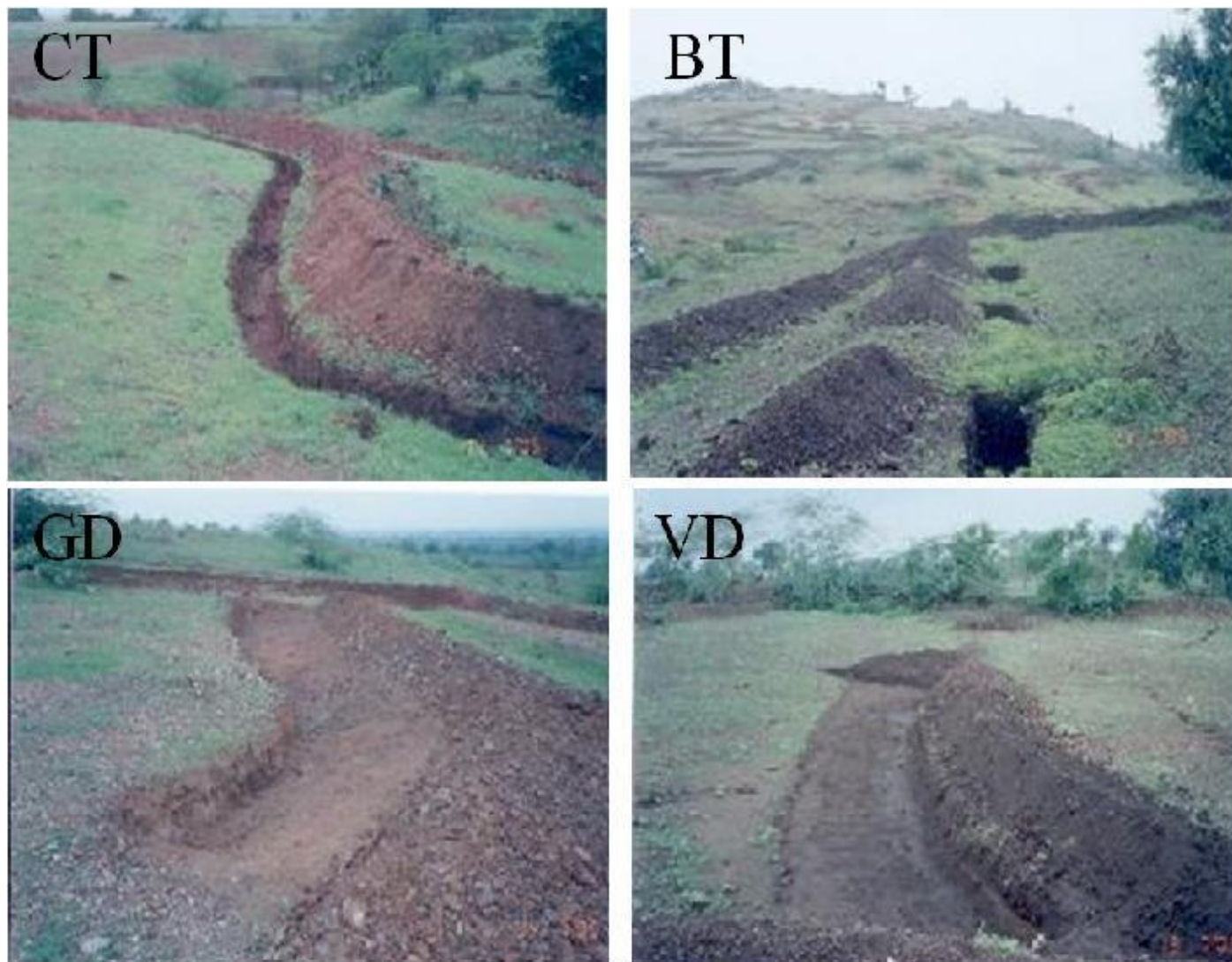
Figure 2. Rainwater harvesting devices applied under afforestation in degraded Aravalli, Rajasthan, India. CT, contour trench; BT, Box trench; GD, Gradonies; and VD, V-ditch.

0.40 cm collar diameter were planted in a pit of size 45 × 45 × 45 cm. There were three slope categories that is, <10% slope, 10-20% slope and >20% and five rainwater harvesting treatments plots replicated five times (distributed in about 17 ha area) to provide 75 plots.