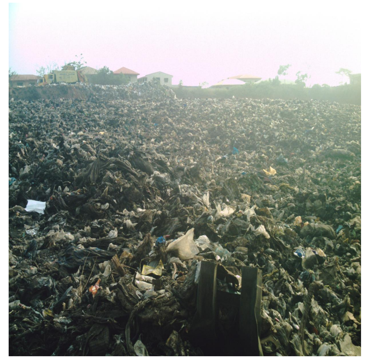
Figure 2. A view of the landfill site, 2009 showing buried waste.

concentration of Fe in groundwater samples varied from 0.18 to 0.91 mg/L and found well above the WHO tolerance levels in 75% of the samples. Zn was observed in the water samples with concentration ranging from ND to 0.02mg/L far below the WHO tolerance value of 5.0mg/l while Pb and Cd were not detected in any of the groundwater samples. However, high levels of these metals were observed in the leachate.