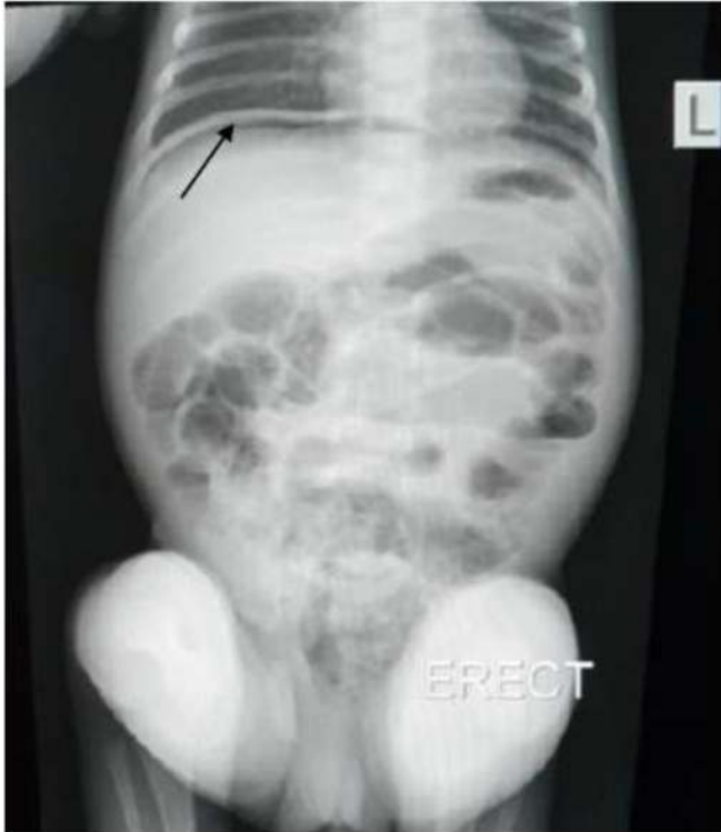
Figure 1. Plain abdominal X-ray showing free air (arrow) under right hemidiaphragm

On the 5th day it was reported that the baby was breastfeeding poorly, had started to develop jaundice, had gradual abdominal distension and failure to pass stools. The patient was started on phototherapy for jaundice. An urgent plain erect abdominal X-ray was done which revealed free air under the right hemidiaphragm (Fig. 1).