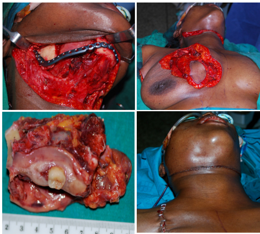
Figure 5. Clockwise: Titanium reconstruction plate, pectoralis major flap with skin paddle for intraoral closure, immediate postoperative, tumour specimen after resection.