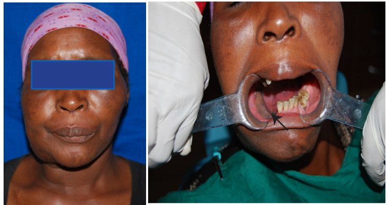
Figure 6. Left, extra oral appearance; right, intraoral appearance. Note the pectoralis major skin paddle (arrow).