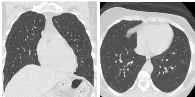
Figure 4. High resolution chest CT scan.

The management of osteosarcoma remains a challenge. First, these tumours remain relatively rare and may be considered as “orphan diseases” (13). In our case series we encountered 25 cases over 26 years. Second, they remain a challenge to diagnose. Our series did have a case that was initially diagnosed as an osteoblastoma. The clinical behaviour of the lesion did not correspond with the histological examination. Tissue specimen was re-evaluated and a diagnosis of osteosarcoma was made. Finally, management of the tumours presents challenges due not only to their aggressive nature but also to a lack of consensus on the mode of management. Literature on the management of maxillofacial