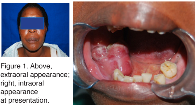
Figure 1. Above, extraoral appearance; right, intraoral appearance at presentation.