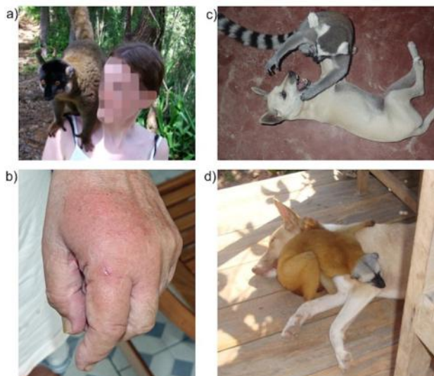
Figure 2. Photographs submitted to the Pet Lemur Survey showing a typical human-lemur encounter by a tourist (a), a scar on the hand of a pet lemur owner in Madagascar from a lemur bite (b), and two different habituated pet lemurs (owned by two different owners) interacting with domestic dogs (c,d).

individuals (63% in 1902, 58% in 1910, 77% in 1960, and between 90% - 97% from 2006 to 2015; Sources B, C, E, G-O, respectively in Table S1) received their PEP treatment in the greater Antananarivo area.