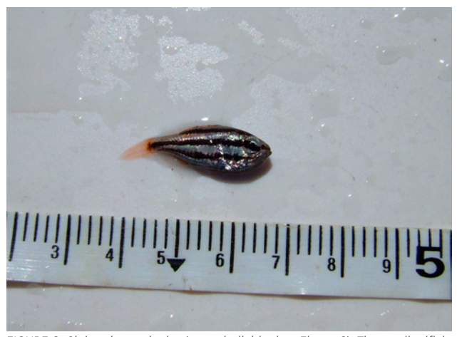
FIGURE 3. Siphamia versicolor (same individual as Figure 2). The cardinalfish appears to be red-black in colour until stressed when the lines become visible.