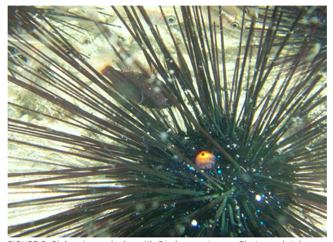
FIGURE 2. Siphamia versicolor with Diadema setosum . Photograph taken at a shallow sandy site (Site 9) where Diadema provided the majority of cover.

dance data in biological monitoring of environmental impacts and show community structure (Clarke and Gorley 2006). In this study we used SIMPEROF, a methodology that identifies the species primarily providing the discrimination between two observed sample clusters. Initially, a pre-treatment was carried out on the data set; a square root transformation was applied to the data in order to downweight any dominant contributions of particularly abundant species in samples (Clarke and Gorley 2006). A resemblance matrix was then produced to show the similarities between pairs of samples using Bray-Curtis similarity; a step necessary prior to any further analysis. Bray-Curtis similarity is the most commonly used similarity coefficient for biological community analysis, as it reflects differences between samples based on community composition and total abundance (Clarke 1993). A CLUSTER dendrogram was produced, showing the hierarchical clustering of samples going into smaller numbers of groups as their similarity to each other diminish