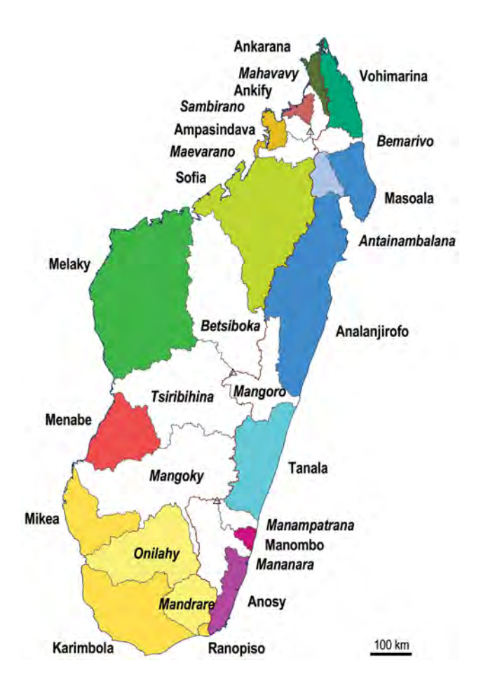
FIGURE 1. Retreat-dispersion watersheds (white – italic) and centers of endemism (colored – regular).

People need to give names to sites or areas to be able to communicate, identify and locate them in space (Kadmon 2000). Geographical names or labels often have a meaning inspired by a location's topography, prominent landscape feature(s), hydrography, or characteristic fauna and flora. A toponym usually reduces the multidimensional complexity of a locale and abstracts the dimensions to one name representing the fundamental traits of it (Conedera et al. 2007). Table 1 lists the already existing toponymy of rivers as mentioned on the topographical