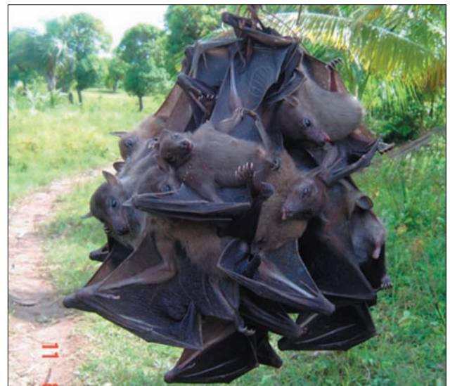
FIGURE 4. The results of a daily hunting trip to a cave roost of Rousettus madagascariensis on Nosy Boraha (Photo: F. H. Randrianandrianina).

BATS AS BUSHMEAT There are few eye-witness accounts from biologists on the seasonality and frequency of hunting or the destination of the bat meat, and most reports are based