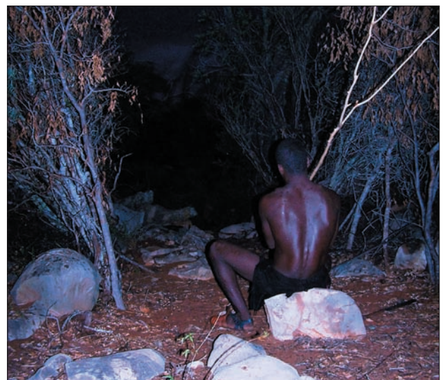
FIGURE 5. A hunter near Itampolo poised at the 'mouth' of a ride cut in the forest from the cave to channel the emerging Hipposideros commersoni towards his long stick.