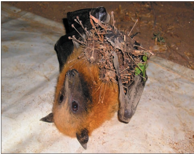
FIGURE 2. Pteropus rufus snared using hook-like plant burrs whilst feeding on kapok trees near Kirindy-Mite National Park