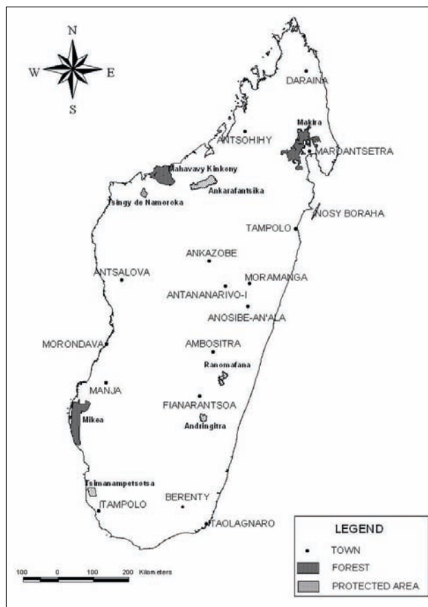
FIGURE 1. Map of Madagascar showing the location of protected areas and towns names mentioned in the text and Table 1.

In this review we collate data on bats as bushmeat, both published and unpublished, and report on general trends with respect to hunting methods, consumption patterns, conservation threats and human livelihood issues. We draw on personal experience in the field since 1998 (PAR) and 2002 (RKB) and have augmented the accounts by personal reports from our Malagasy colleagues engaged as either employees or students in successive projects organized by the University of Aberdeen and funded by the Darwin Initiative (1999-2005). Information on bat hunting was obtained through direct observations as well as informal discussions with people in a range of sites across the island (Figure 1).