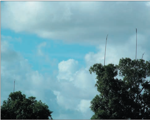
FIGURE 6. Support poles for nets set permanently around the edge of a Pteropus rufus roost in western Madagascar.

on informal interviews (Rakotoarivelo and Randrianandrianina 2007, Rakotonandrasana and Goodman 2007) or brief observations (Goodman 2006). Quantitative information in particular is lacking and this prohibits a thorough assessment of sustainability. Nevertheless, it is possible to obtain an overview of the way in which bat bushmeat is traded and used in Madagascar.