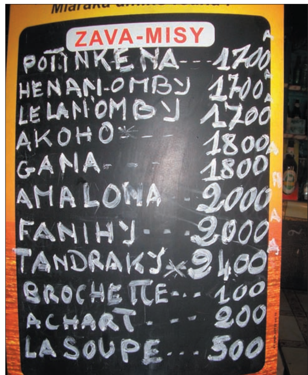
FIGURE 7. A menu in a roadside restaurant in western Madagascar during July 2007 showing the price of fruit bat fanihy as 2,000 ariary or $1 US. Other meats on the menu are omby (beef), akoho (chicken), gana (duck), amalona (eel) and tandraky (tenrec). (Photo: F. H. Randrianandrianina).

considered hunting to represent a minor threat to P. rufus in the north of Madagascar, but noted that this species was frequently served in local restaurants. Other evidence suggests that, at least locally, current patterns of exploitation are unsustainable and this is obviously of concern to conservationists and those who depend on the bats for income and nutrition. Local