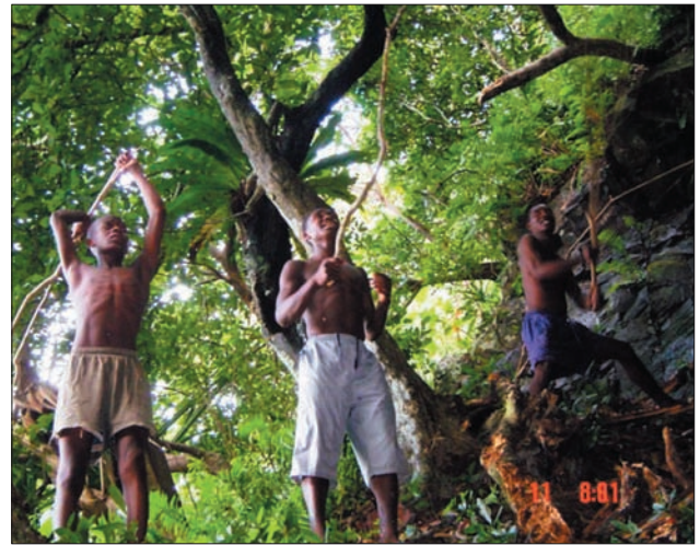
FIGURE 3. Hunting Rousettus madagascariensis on Nosy Boraha: one man in the cave disturbs the bats by throwing sticks and his fellow hunters wait at the cave entrance to strike emerging bats.

flyways were cleared in the vegetation surrounding the cave entrance and the bats were swatted with a wooden whip-like baton as they emerged (Figure 5).