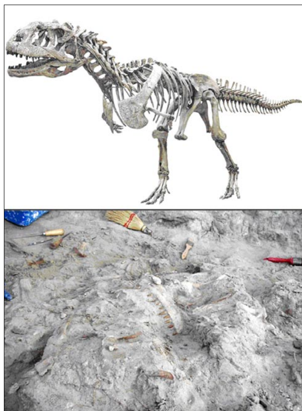
FIGURE 1. An exact replica of the skeleton of the theropod dinosaur Majungatholus atopus from the Late Cretaceous of Madagascar (above), based on a composite of specimens, and the excavation site from which one of the specimens was recovered (below).

The Late Cretaceous fossil record from Madagascar is providing the highest quality information on the anatomy and