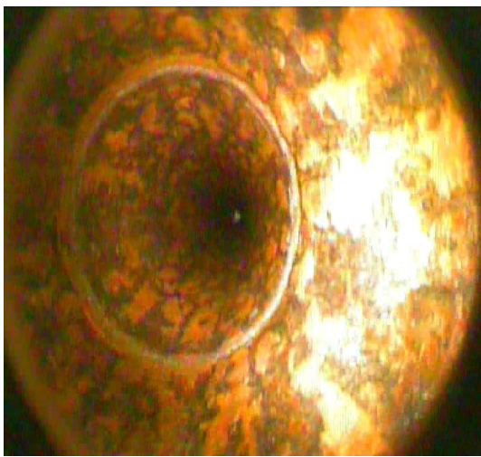
Fig. 3 Rusted Casing Material at BH1

The camera inspection of the Dunkwa BH 3 borehole indicated a composite borehole design with screen positions located between 9 - 21 m, 27 -30 m and 39 - 43 m, and plain PVC elsewhere over a borehole of 45 m depth. The diameter of the borehole is 6". Biofilming was observed on portions of the screen and plain (Fig. 4). Water was slightly sand-laden. The PVC as observed from the inspection showed no indication of compromised integrity.