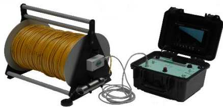
Fig. 2 Borehole Camera and Accessories

Camera inspection was carried out to obtain adequate information on the state of the various casings which had been used to align the boreholes and also to ascertain whether the screen used for the construction of the boreholes are clogged. The PASI TC-30 Color Borehole Inspection Camera setup was used (Fig. 2). With its semi-rigid 30 meter fiberglass cable reel with sliding contacts, attached 5.6" TFT LCD color monitor and 12 volt battery, it is portable. The 36 mm diameter camera head can be easily pushed inside vertical or horizontal holes of small diameter. The TC-30 can be connected to any VCR or any monitor with a video input. The camera unit has an integrated LCD display showing the camera image, camera head distance readout, battery monitor, date and time. The unit also has a digital video recording facility. The rechargeable battery pack and memory storage is sufficient for the camera to record approximately 4 hours of footage.