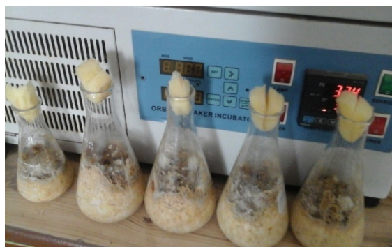
Fig. 1 A 10-day culture of P. chrysosporium

MRC Orbital Shaker Incubator. Oxygen was introduced into the culture by partially covering the flasks with a piece of foam as shown in Fig. 1. Fungal growth was assessed to be efficient after the incubation period by visual inspection.