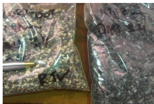
Fig. 2 Dense Medium Separation Products

Fig. 2 shows the concentrate and tails samples from a dense media test work trial. The darker coloured product is clearly the concentrate separated from the tailings product.