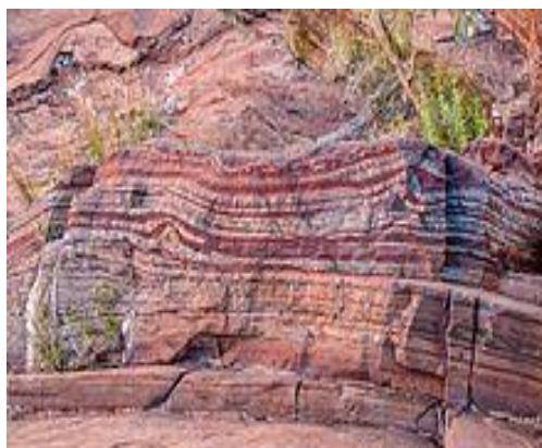
Fig 1. Band Iron Formation