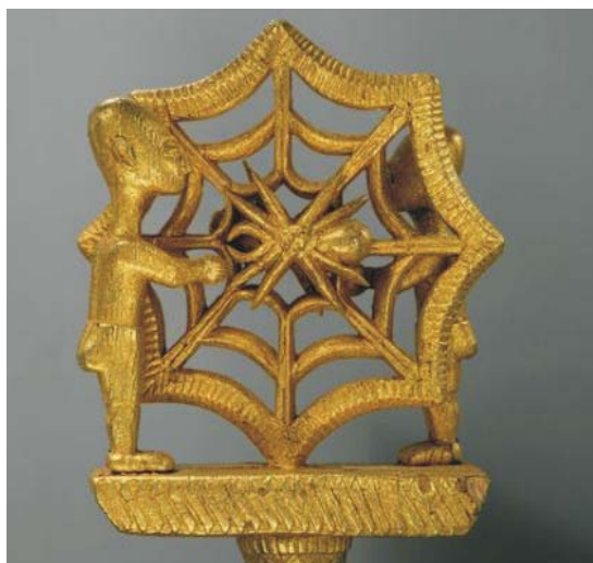
Fig. 3 The Finial of Traditional Linguist Staff

The mace derives from an ancient club-like weapon that was later adapted as a ceremonial symbol of authority by the Babylonians and Assyrians as early as 700 BC. This decorated version was also used to protect the king's person, borne by the Sergeants-at-Arms, a royal body guard established in France by Philip II (Anon, 2008). The significance of the mace has gone beyond its original use as a medieval weapon. Today, it has been transformed into a highly ornamented staff of metal and wood carried before a sovereign or high official as a symbol of authority in rituals and processions. Indeed, according to Galloway (2008), in Canada's Parliament, the legislators have no authority under which to make or repeal laws until the mace has been placed on the table before the Speaker's chair.