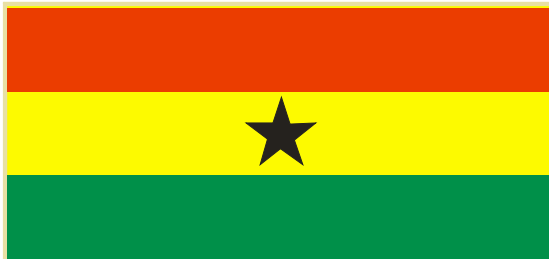
Fig. 2 The Ghana Flag

who fought and shed their blood to gain independence for Ghana; yellow represents the mineral wealth of Ghana and green the agricultural wealth of Ghana. The black star stands for the hope of Africa.