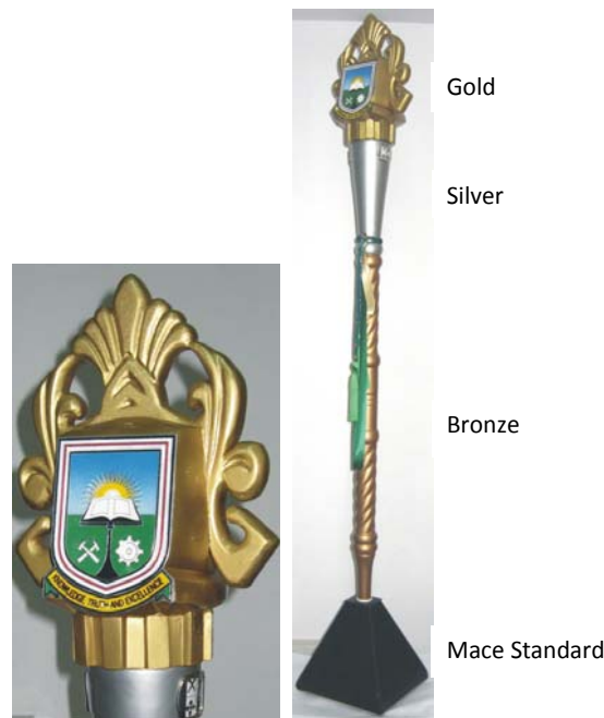
Fig. 6 UMaT Ceremonial Mace

UMaT mace is divided into three main chromatic sections. The three (3) main chromatic sections