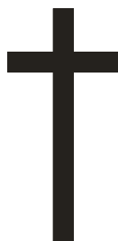
Fig. 1 The Crucifix

The use of symbols can be traced as far back as the Paleolithic Art (or cave art over 11 000 years ago) through the Feng Shui Horse which is a symbol for authority, power, success and growth (Guru, 2007), to the Crucifix (Fig. 1) which symbolizes the death, faith and resurrection of Jesus Christ and considered the perfect symbol of Christ's crucifixion in the Christian religion. These symbols are essentially an object or iconography which may represent a person or an authority, and express an idea, value, or quality; animate or inanimate.