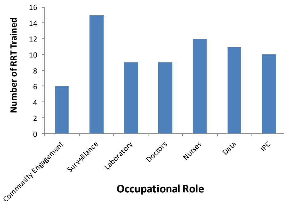
Fig 1: RRT members trained to combat EVD in ZAMBIA