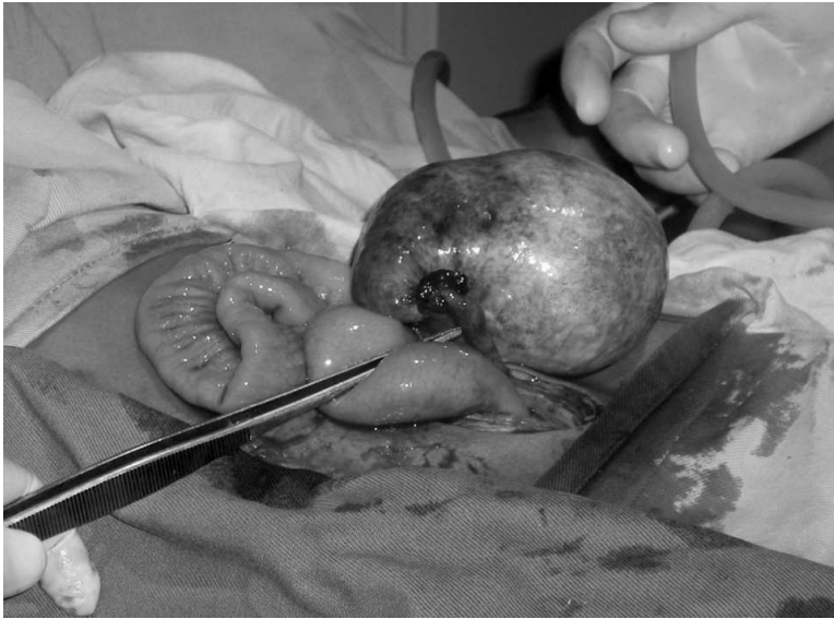
Figure 1: Intraoperative image of right ovarian mass measuring 60x45mm.