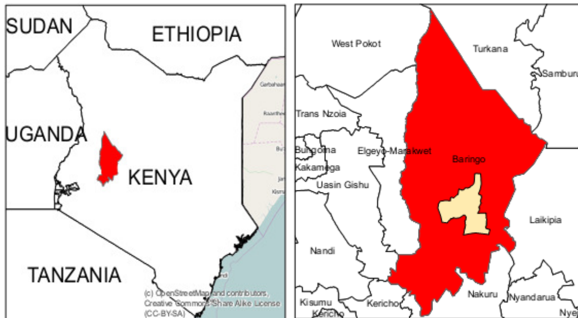
Figure 1: Location of the study area (left: Baringo County in relation to Kenya, right: Marigat Division in relation to Baringo County)

The major topographical features are river valleys, plains and the floor of Rift Valley. The area is on Loboï plain and is characterized by rolling slopes that range from 5% to 25% towards downstream of the rivers. The location of the study area is shown in Figure 1.