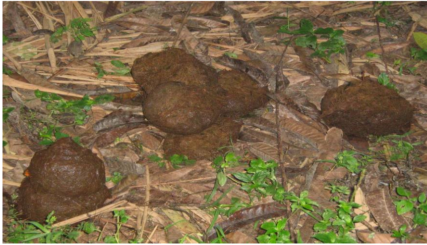
Plate 5: Fresh dung of elephant along transect C