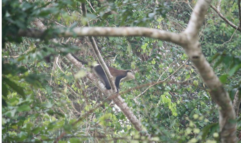
Plate 2: The mona monkey in matured forest habitat of Arakhuan Range (ONP)