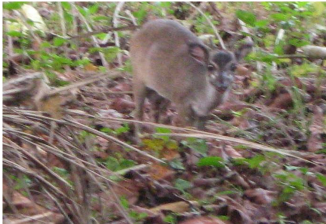
Plate 3: The maxwell's duiker along the forest margin habitat of Arakhuan Range (ONP)