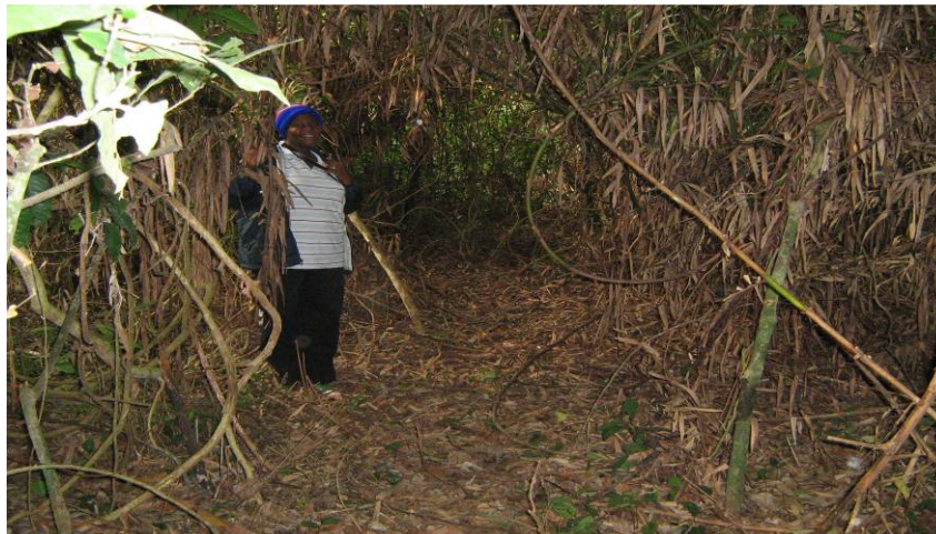
Plate 4: The elephant trail along transect A of Arakhuan Range (ONP)