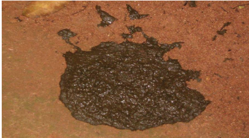
Plate 6: Fresh dung of buffalo along transect C