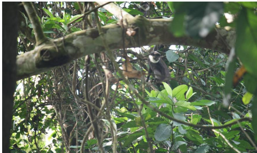
Plate 1: The white throated monkeys in thicket forest habitat of Arakhuan Range Okomu National Park (ONP)