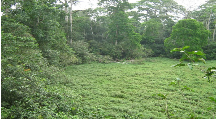
Plate 7: Forest margin along “lakes” like this supports the red river hog in Okomu National Park