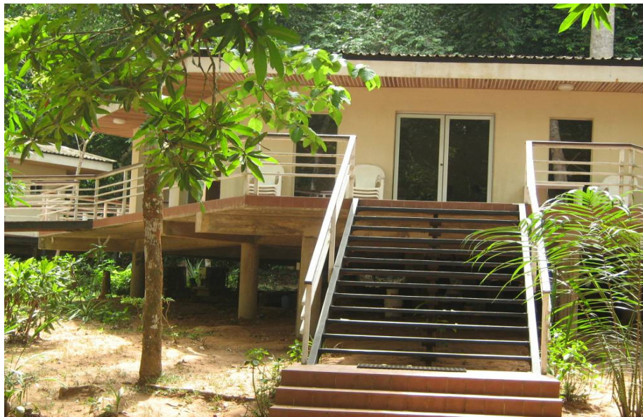
Plate 8: The executive chalets at Arakhuan Base Camp, Okomu National Park (ONP)