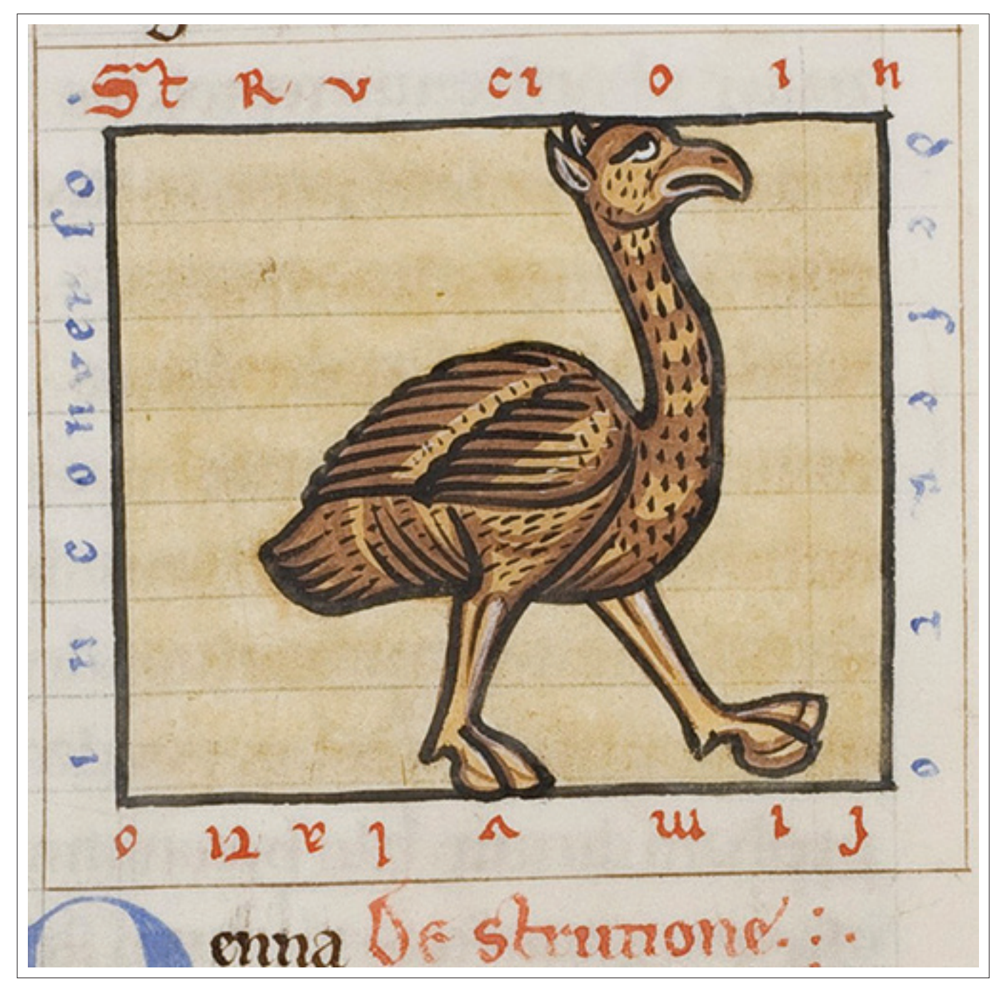
Source: The Medieval Bestiary, n.d., The ostrich has hooved feet and ears, viewed n.d., from http://bestiary.ca/beasts/beastgallery238.htm# FIGURE 3: The ostrich with hooves and ears.

The prevalent medieval views on the irregular features of the ostrich appear in several versions of medieval Arab adab (أدب) literature and zoology books (the adab literature is secular literature on a range of topics aimed at presenting wide general knowledge necessary for educated people). One of the major sources dealing with this is the encyclopaedic compilation by Fadl Allāh al-'Umarī (نصن الله العمري), a geographer and historian who lived and operated in Damascus in the 14th century (1301–1349). Similar to Hadasi, al-'Umarī too claims that this is a creature comprised of a fowl, camel and beast, but he attributes its body parts to the animals mentioned previously. Al-'Umari 1988–1989) writes: