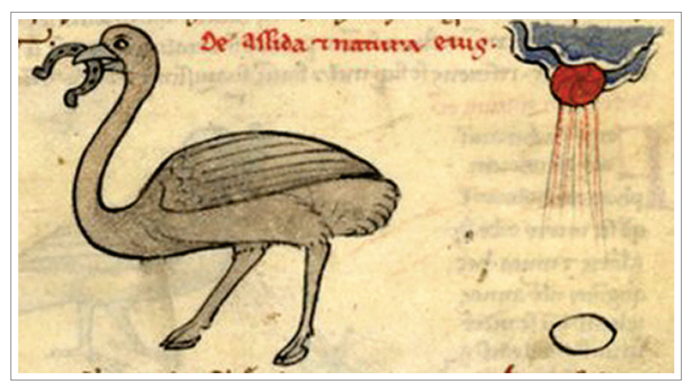
Source: The Medieval Bestiary, n.d., The ostrich eats an iron horseshoe while ignoring its egg behind it, which is being warmed by the sun, viewed n.d., from http://bestiary.ca/beasts/beastgallery238.htm# FIGURE 5: The ostrich eats an iron horseshoe while ignoring its egg behind it, which is being warmed by the sun.

Jewish sources in the middle ages and in modern times mention the unusual food of the ostrich in several contexts not mentioned in rabbinical times, for example, with regard to whether it can be eaten under Jewish standards. As stated above, the sages identified the ostrich with the bat ya'ana mentioned in the biblical list of impure birds