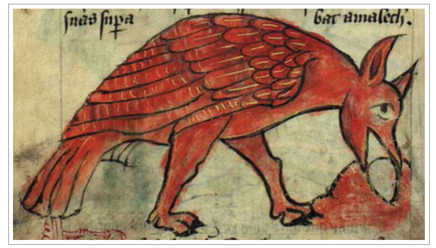
Source: The Medieval Bestiary, n.d., An ostrich with head looks like a dog or another animal, placing its egg on the sand, viewed n.d., from http://bestiary.ca/beasts/beastgallery238.htm# FIGURE 4: An ostrich with head looks like a dog or another animal, placing its egg on the sand.

Al-'Umari compares the digestive capacity of the ostrich to the ability of the dog's stomach to digest bones, and this comparison as well may be an inseparable part of the folkloristic approach that, because of its hybrid nature, the ostrich has an array of unique qualities characteristic of other animals. Interestingly in several drawings, albeit from a European source, the ostrich is described as having ears (Figures 2–4), although birds have no auricle. It is not