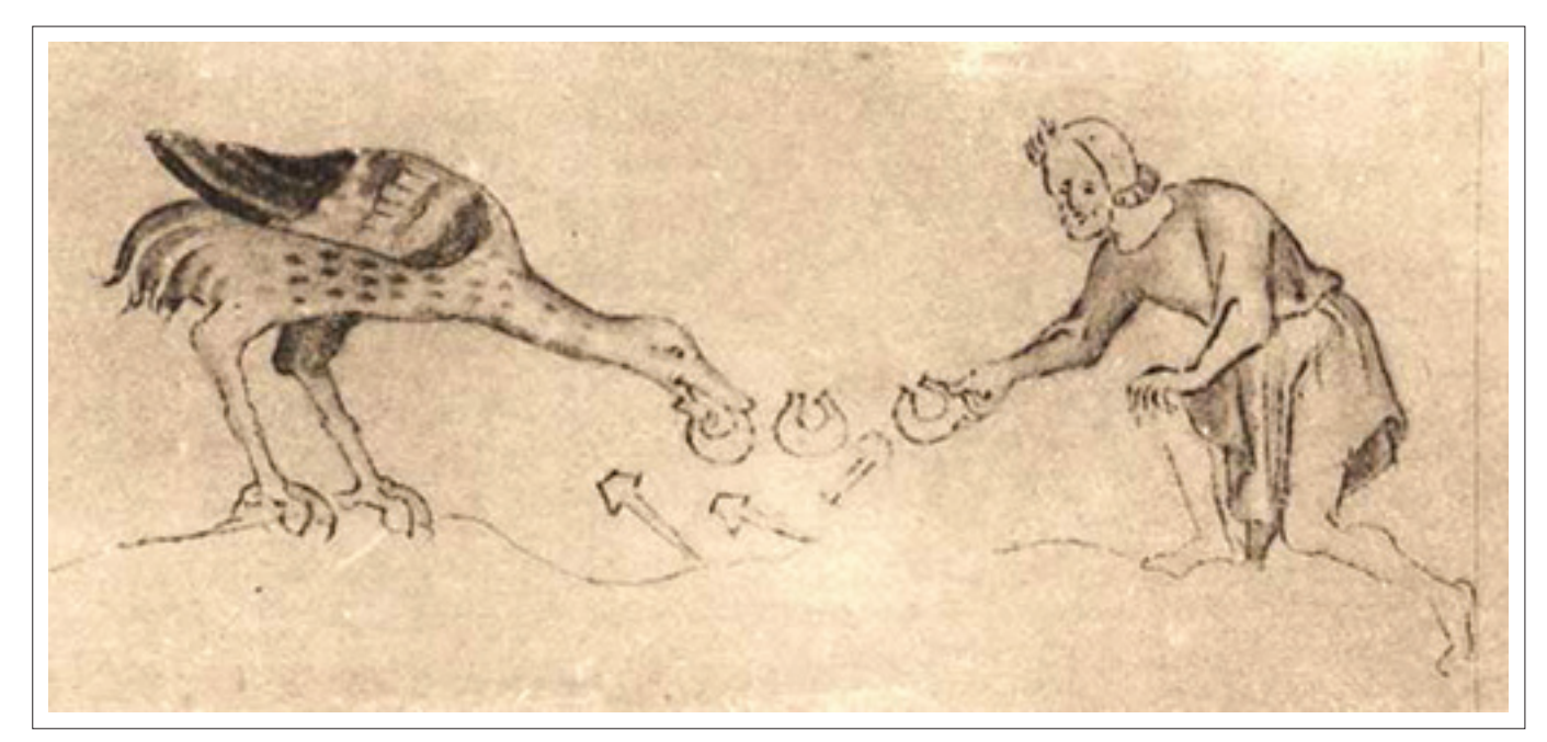
Source: The Medieval Bestiary, n.d., The ostrich has a strong stomach so it can eat iron horseshoes and nails., viewed n.d., from http://bestiary.ca/beasts/beastgallery238.htm#