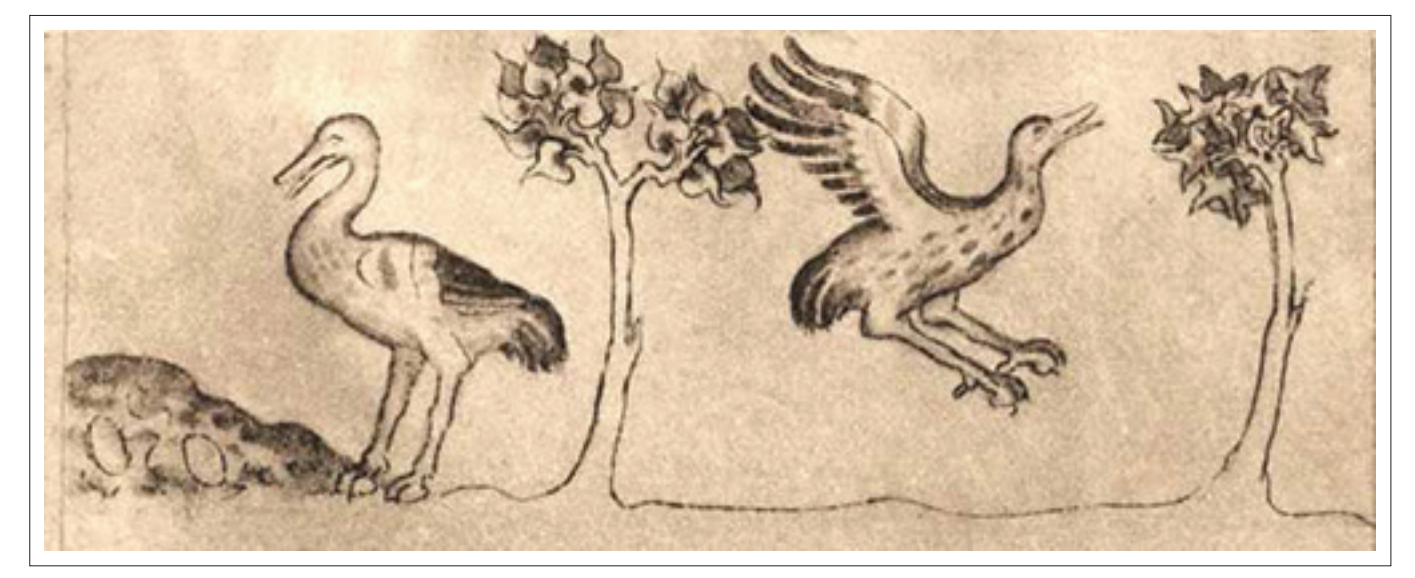
FIGURE 1: Left: The ostrich lays its eggs on the ground. Right: It makes an attempt to fly, though it cannot.

The Arab writer al-Jāhiz (الجاحظ), who lived and operated in the city of Basra in the 9th century AD (d. 869), states in his great zoological composition Kitab al-Hayawan (کتاب الحیوان) 'Book of the Animals') that in Persian the name of the ostrich is shetur morg (شتر مرغ), that is, camel-fowl, but he expresses reservations in this regard and adds: