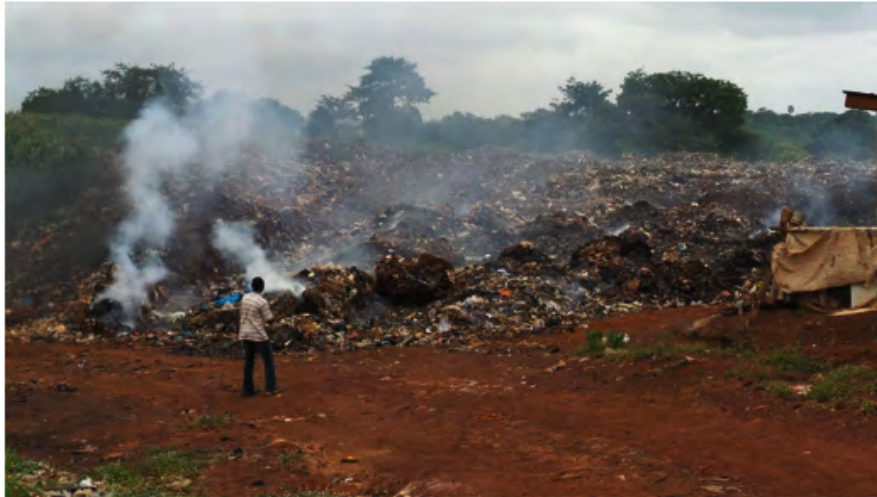
Fig. 3 Open landfill site in Techiman municipality showing open burning of refuse, poor access road and scavenging of plastic waste.

more waste until the overflowing waste at the edges of the landfill site had been shoved. When that happens we do not collect and transport additional waste from the transfer stations. Again, the deplorable state of the roads make them unmotorable when it rains. The trucks cannot access the landfill site”.