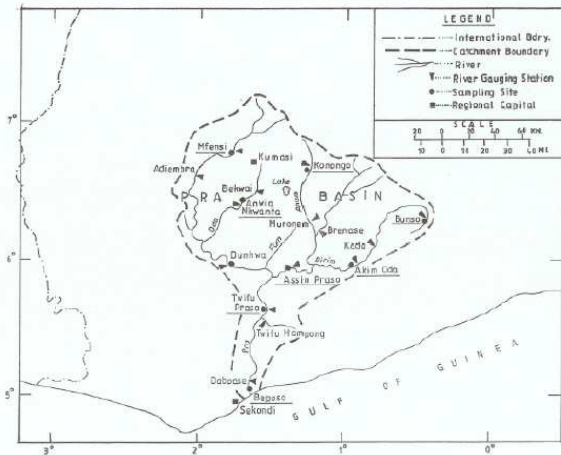
Fig. 1. Map of Pra Basin showing Sampling Sites

The Pra basin (Fig. 1), being part of the South-western basin system in Ghana, has a drainage area of 23188 km 2 and an estimated mean annual discharge of 214 m 3 s -1 . It is quite humid (relative humidity 60–95%) with annual rainfall in the range of 1500–2000 mm. The average maximum and minimum temperatures are 32 °C and 21 °C, respectively, for the cooler periods of June–September/October. The basin comes strongly under the influence of the moist south-west monsoons during the rainy season. The primary vegetation consists of moist semi-deciduous forest.