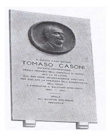
Figure 5. Photo of the plaque erected by the Municipality of Imola at the house where Casoni was born in Imola commemorating his life and works. Courtesy of the Citta Di Imola, Servizzio Biblioteche e Archivi. Imola, Bologna, Italy