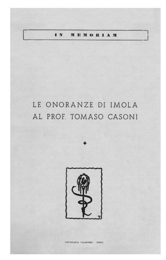
Figure 4A &4B. The cover pages of the two small booklets issued to commemorate the life and work of Tomaso Casoni.