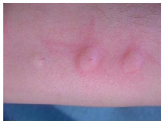
Figure 2. The typical skin reaction in a positive Casoni

members, there were only a few doctors (mainly who looked after him in his short hospital stay). Only a few had been aware of his return home after so many years of absence.