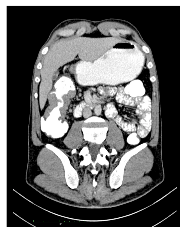
Figure 2: A computed tomography scan of the abdomen showed an asymmetric circumferential short segment of non-homogeneously enhanced wall thickness up to 20 mm at the hepatic flexure and adjacent ascending colon with luminal narrowing.

The biopsy was suggestive of poorly differentiated adenocarcinoma. A computed tomography scan of abdomen showed an asymmetric the circumferential short segment of nonhomogeneously enhanced wall thickness up to 20 mm at the hepatic flexure and adjacent ascending colon. The thickened wall caused a luminal narrowing with adjacent extensive fat stranding, which suggested the possibility of a malignant mass lesion (Figure 2).