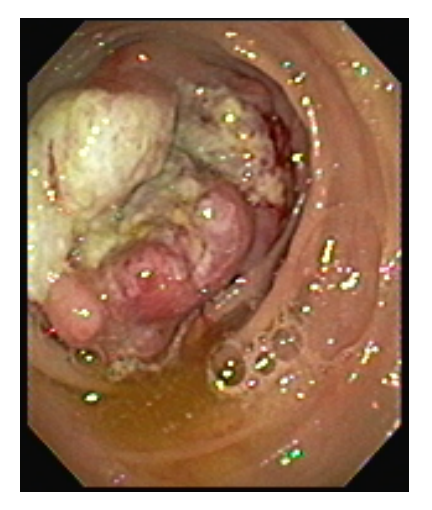
Figure 1: An ulceroproliferative lesion at the hepatic flexure of the colon

occasional black stool." On examination, a lump was palpable in the right upper abdominal quadrant. His laboratory results showed severe microcytic hypochromic anemia with hemoglobin 5.2gm %. The fecal occult blood test was positive. Ultrasonography of the abdomen suggested thickening over the hepatic flexure and ascending colon with multiple mesenteric lymph nodes. Tuberculosis of the GI tract was suspected. We performed a colonoscopy after preparation of the bowel, and found an ulceroproliferative lesion at the hepatic flexure of the colon ( Figure 1 ).