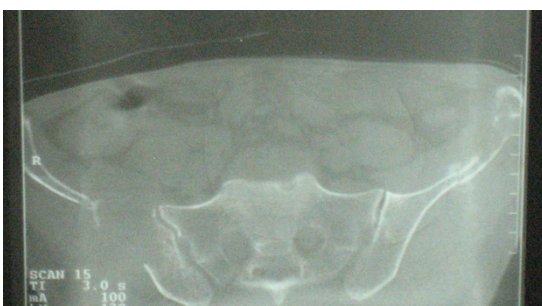
Figure 2: CT scan of pelvis showing multiple lytic lesions