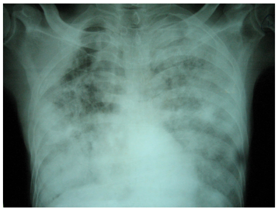
Figure 1: CXR showing bilateral infiltrates with normal cardiac size suggestive of ARDS

carcinoma was made. Meanwhile in spite of mechanical ventilation the patient expired within 72 hours before renal biopsy could be performed and facility of autopsy was not available at our center.