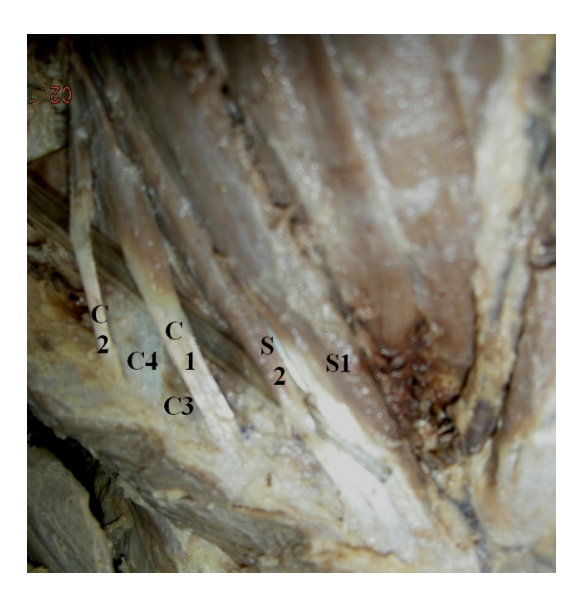
Figure 1: Photograph showing six heads of sternocleidomastoid muscle: S1 medial sternal head, S2 lateral sternal head, C1 medial superficial clavicular head, C2 lateral superficial clavicular head, C3 medial deep clavicular head, C4 lateral deep clavicular head

fossa. The left SCM was found to be without any variation.